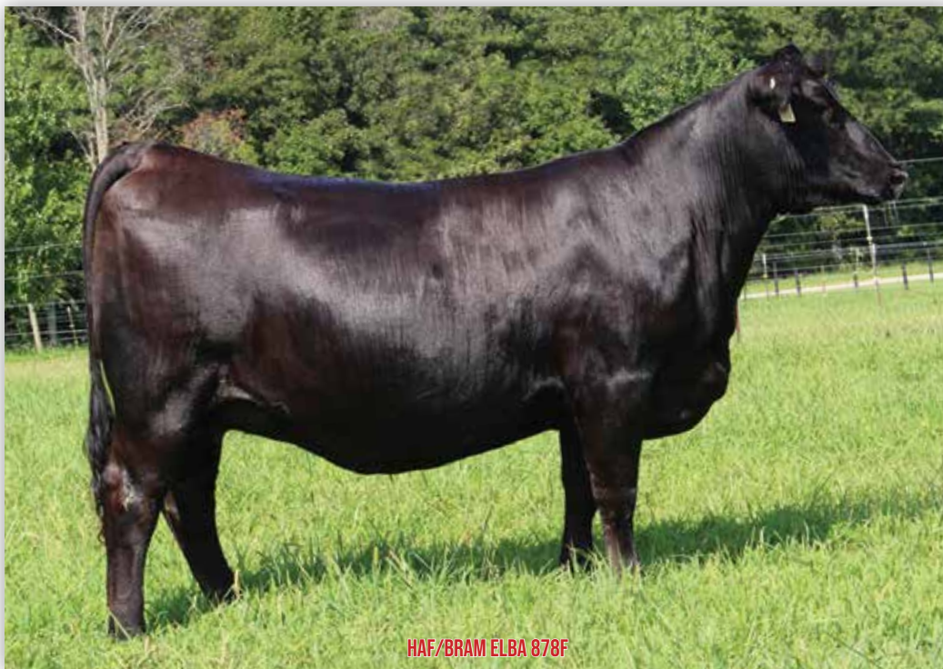
HAF/BRAM ELBA 878F

• We are extremely proud to be offering this female at the Head of the Class. 878F is the definition of the kind of cattle we are trying to produce. She is so elegant in her makeup, bold and soft in her middle, and all wrapped up in an ultra-smooth sound package. The Elba cow family has done everything we have asked it to do by making efficient, attractive, sound good-doing cattle. 878F is due to calve shortly after the sale to Hammertime. We are committed to selling our best or this one wouldn't be here. This female will definitely be worth the trip to Louisburg, BIG TIME bred right here!