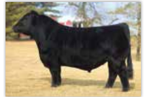
CDI INNOVATOR 325DL - REF. SIRE