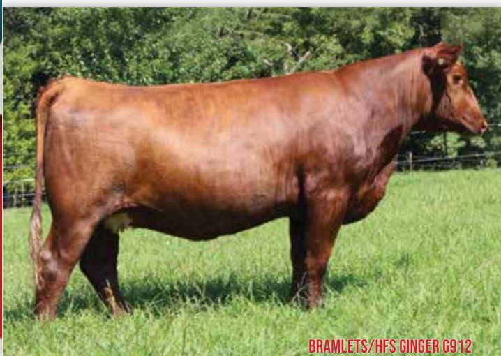
BRAMLETS/HFS GINGER G912

CE 11 BW -0.2 WW 68 YW 99 MCE 5 Milk 18 MWW 52 Marb 0.29 REA 0.83 API 131