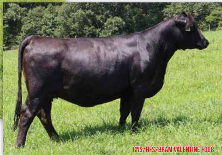
CNS/HFS/BRAM VALENTINE F008