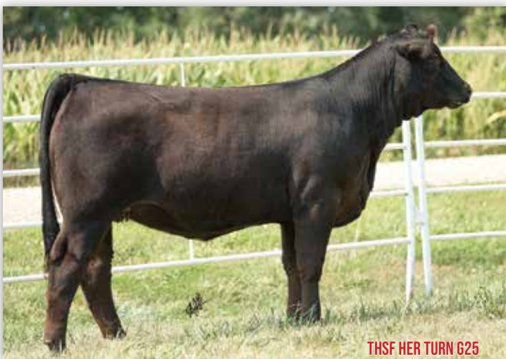
THSF HER TURN G25

• This Dew North daughter is a product of a lot years of planning. Great grandmother is the 2012 Sweepstakes Supreme. Grandmother was a SAV Brilliance Daughter that won Illinois state fair in 2016. Her Relentless mother is as ideal of a first calf Heifer you can find. Cool-faced baldy w a tremendous set of EPDs.