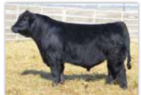
KBHR HIGH ROAD E283 - REF. SIRE