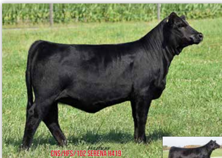
CNS/HFS/102 SERENA H419

This is a female and a pedigree that is sure to grab anyone's attention. Sired by the ASA Ring of Champions Show Bull of the Year AND the Exhibitors Choice Bull of the Year, B C R Perfect Vision (a big congrats to all involved in this at Buck Creek Ranch and Hicks Cattle), H419 is so smooth made and complete she is hard to fault. A structure that is designed for the long haul, the extension and eye appeal to get anyone's attention, and the softness of rib required in all aspects of our industry H419 brings it all to the table. Backed by possibly one of the best and most consistent cows the breed has ever seen, HF Serena, it's no surprise H419 is so good. Take advantage here to obtain not only a big time show heifer for your string, but a royally bred future donor for your herd!