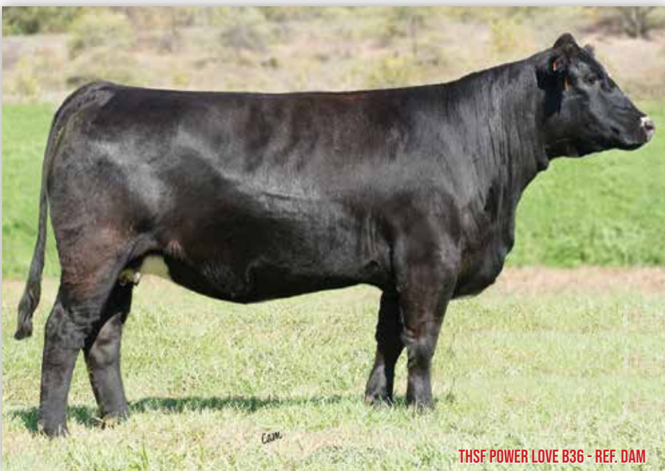
THSF POWER LOVE B36 - REF. DAM