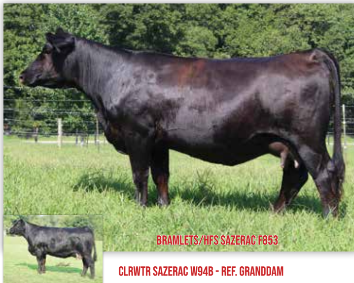
BRAMLETS/HFS SAZERAC F853