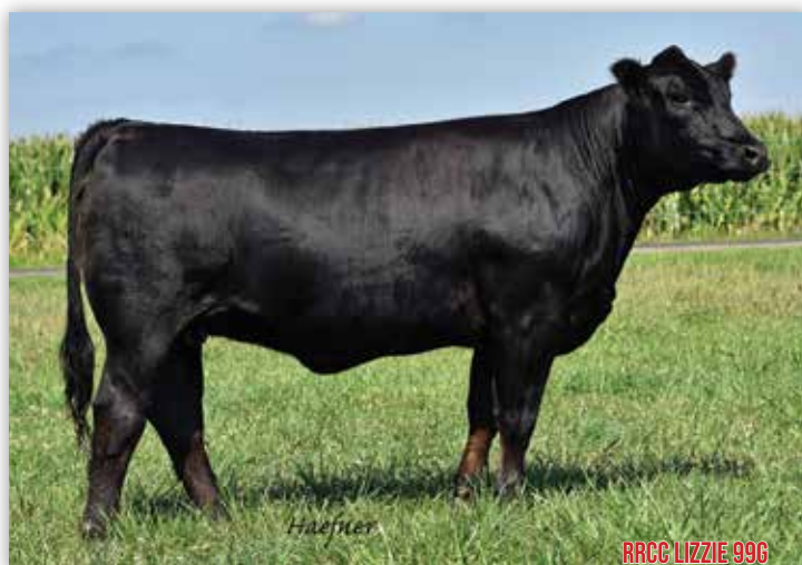
RRCC LIZZIE 99G