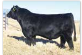
THSF LOVER BOY B33 - REF. SIRE