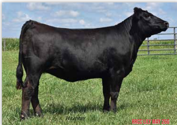
RRCC LILY MAY 26G

• Bred AI to Mr CCF Clarified E3, ASA#3275273 on 5/20/20, Due 2/26/21