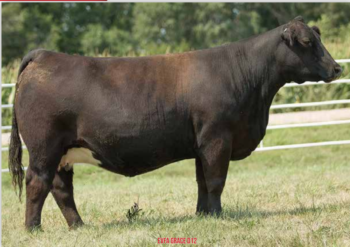
EVFA GRACE D12