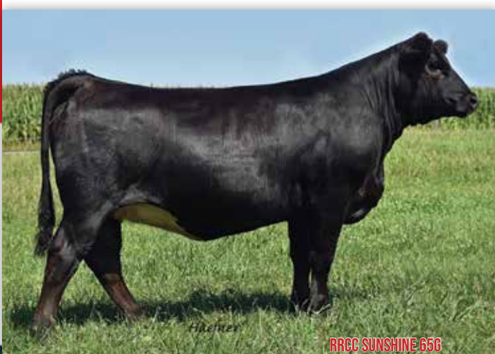
RRCC SUNSHINE 65G