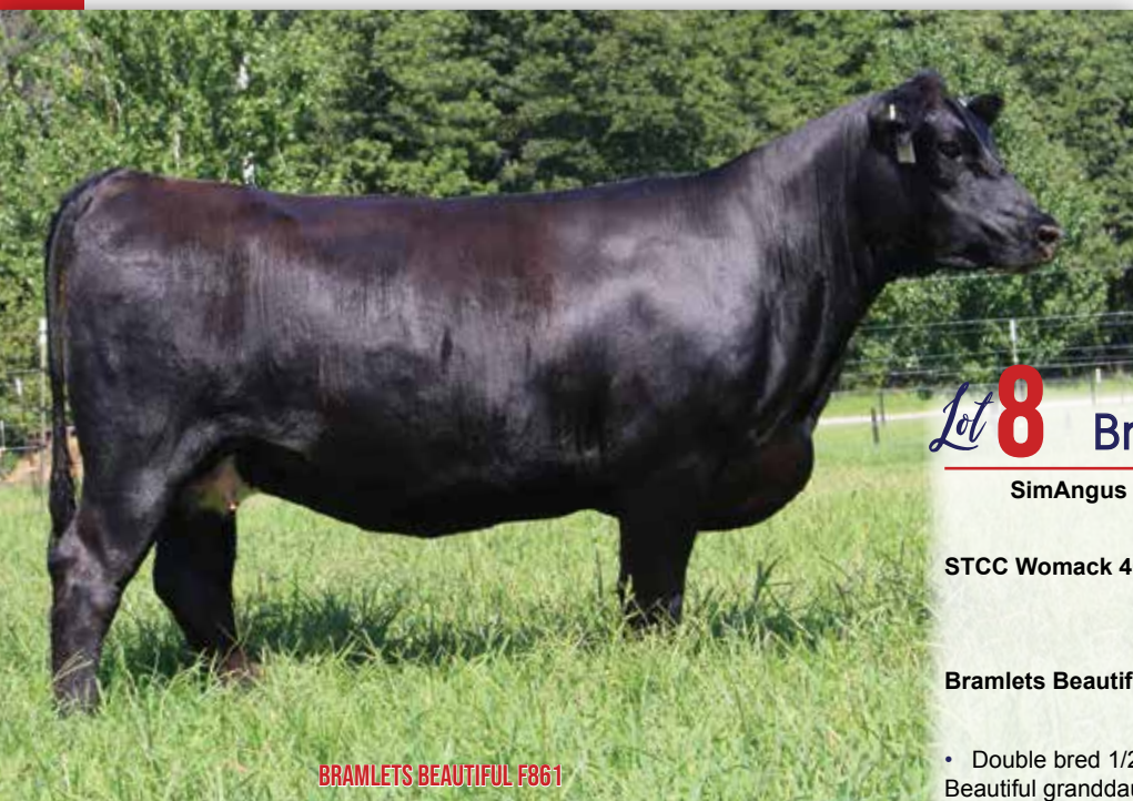
BRAMLETS BEAUTIFUL F861

• Bred AI to TJSC Hammer Time, ASA#3185062 on 3/1/20