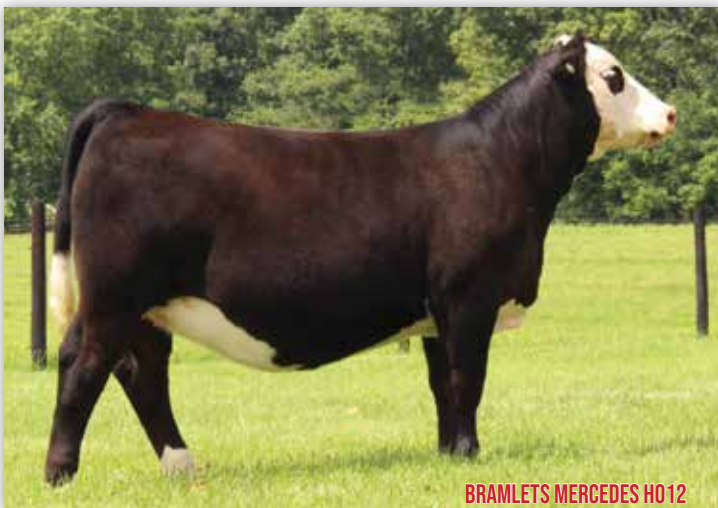
BRAMLETS MERCEDES H012