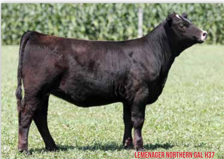
LEMENAGER NORTHERN GAL H37

• Talk about the "wow" factor here. It could be her added color, massive center, or that freak neck on her. You be the judge. She is backed by one of our top cow families, Mercedes, and by Clarified. We are huge fans of all our Clarified calves. This female has a super sweet personality and perfect for the beginner showman. Don't miss the opportunity to catch the judge's eye with this one.