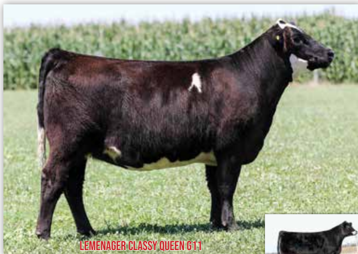
LEMENAGER CLASSY QUEEN G11

• Bred AI to WLE Uno Mas X549, ASA#2532016 (sexed heifer semen) due 1/1/21