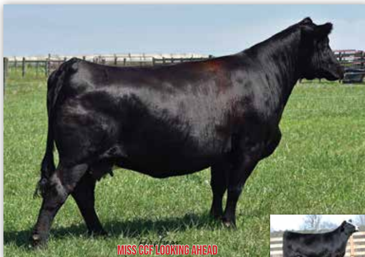
MISS CCF LOOKING AHEAD