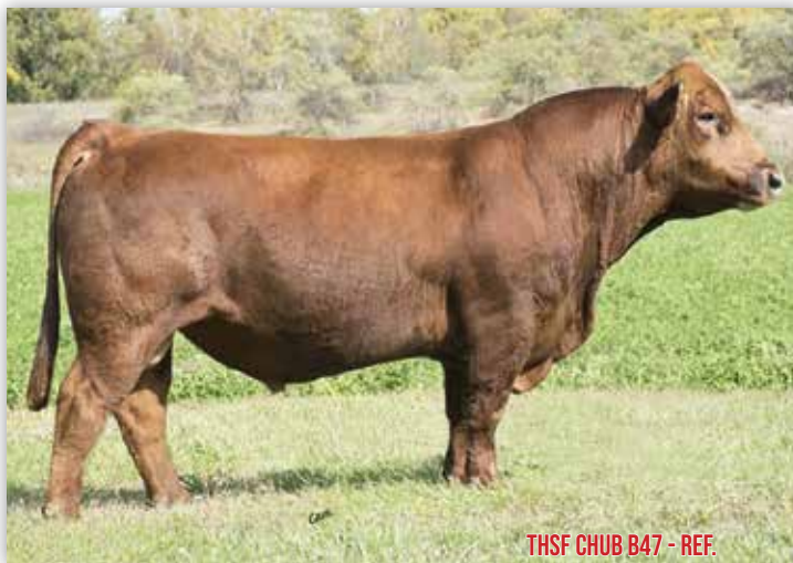
THSF CHUB B47 - REF.

Selling 2 lots of 10 Units. We will miss this bull in our program. This Freedom x 015U red bull had the wow factor. Chub is a brother to Lovely B57.