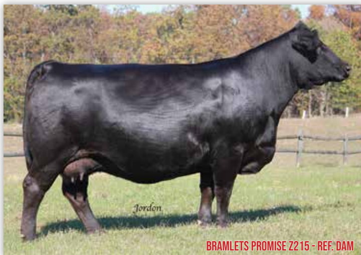
BRAMLETS PROMISE Z215 - REF. DAM