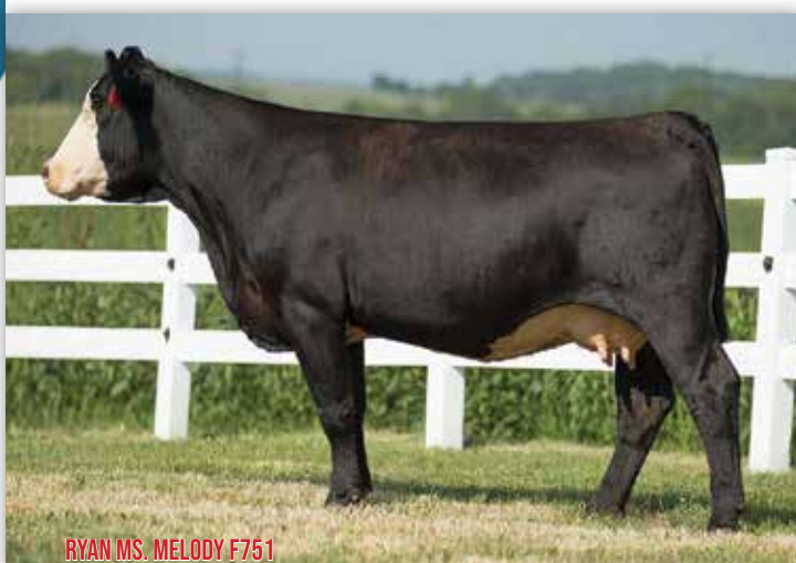
RYAN MS. MELODY F751

45A | Pending | 4/3/20 | Heifer | HILB Collusion F1D, ASA#3547469