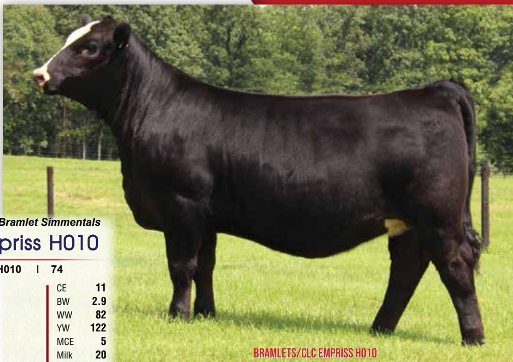
BRAMLETS/CLC EMPRISS H010

• H69 is out of the popular W/C Pinnacle bull which was the high selling bull at the Walsh dispersal. Pinnacle is a full brother to Bankroll. Her dam is Grand Fortune x Hard Core. I feel this one will have a few lookers come sale day.