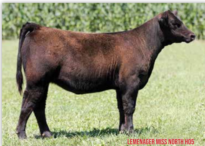
LEMENAGER MISS NORTH H05