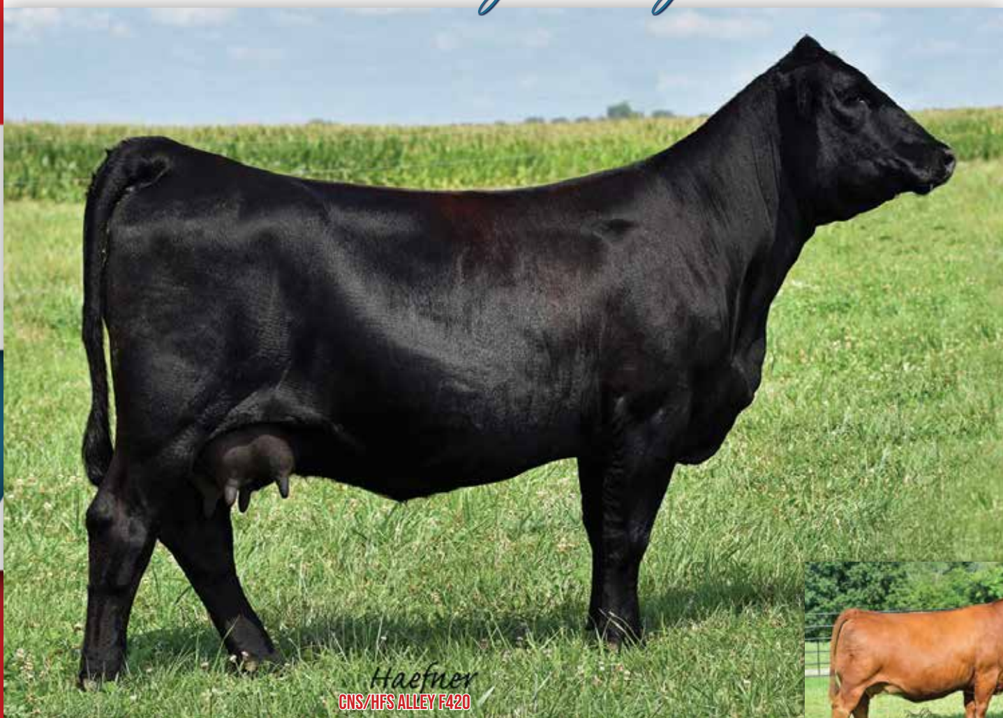
Haefner CNS/HFS ALLEY F420