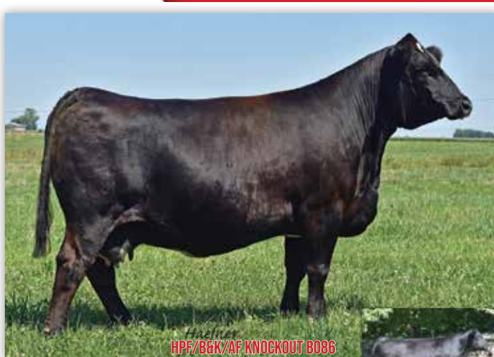
HPF/B&K/AF KNOCKOUT B086

Bred AI to Mr CCF Clarified, ASA#3275273 on 5/9/20, Due 2/15/21