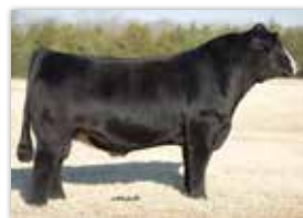
SVF STEEL FORCE - REF. SIRE