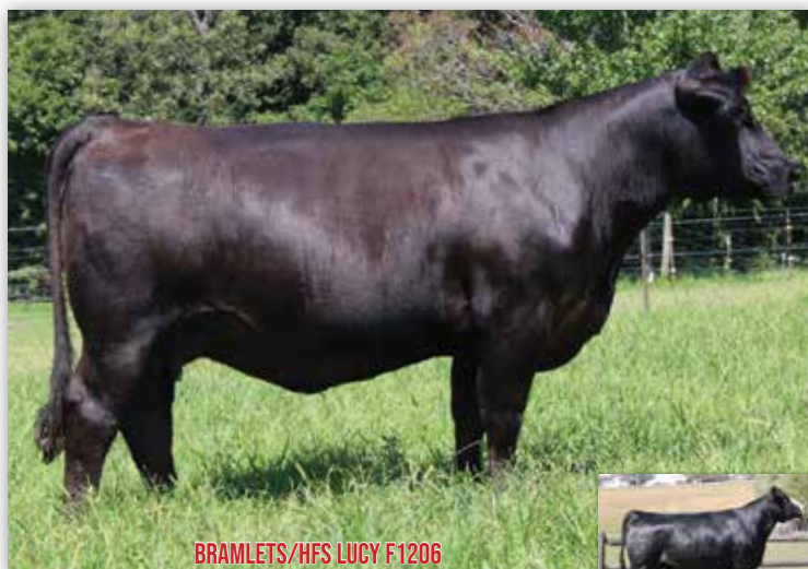
BRAMLETS/HFS LUCY F1206