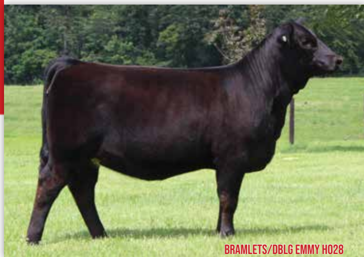
BRAMLETS/DBLG EMMY H028