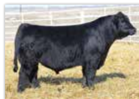
KBHR HIGH ROAD E283 - REF. SIRE