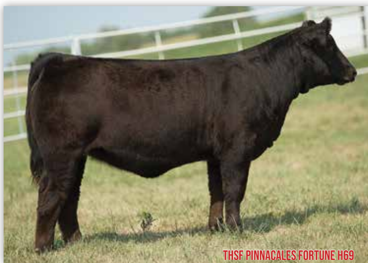
THSF PINNCALES FORTUNE H69