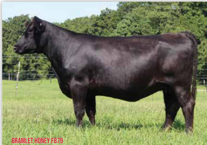
BRAMLET HONEY F879