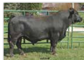
THSF MR PRECISE 456P - REF. SIRE