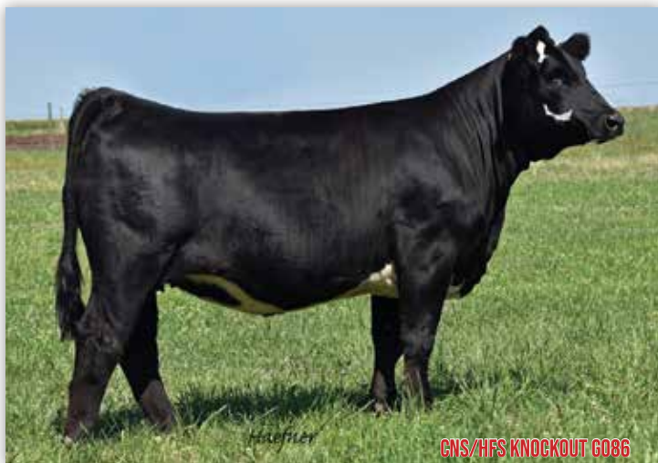
CNS/HFS KNOCKOUT G086

• Bred AI to WLE Mas X549, ASA#2532016 (sexed heifer semen), due 2/3/21