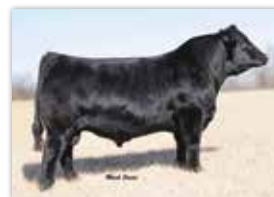
HTP/SVF DURACELL T52 - REF. SIRE