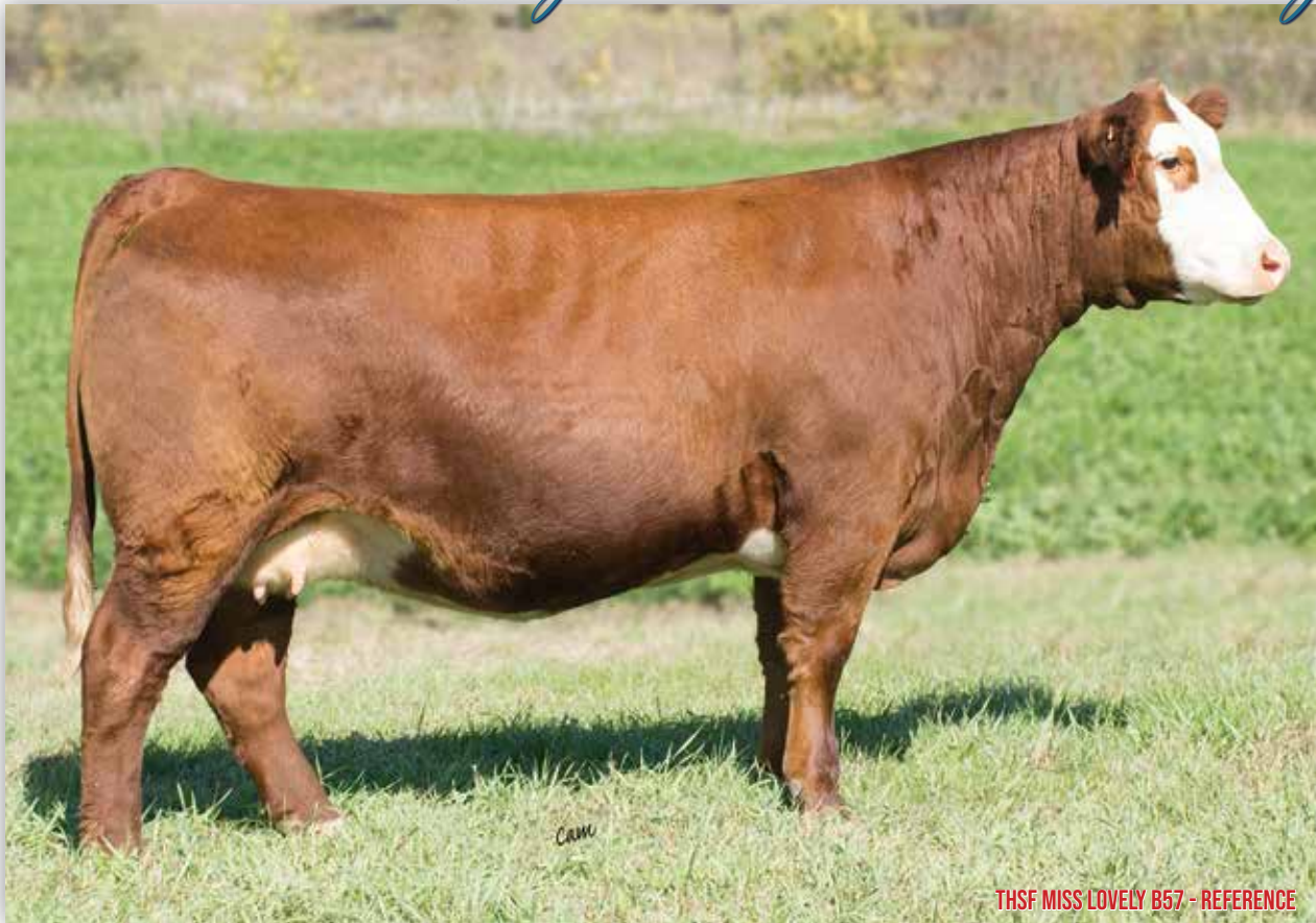
THSF MISS LOVELY B57 - REFERENCE