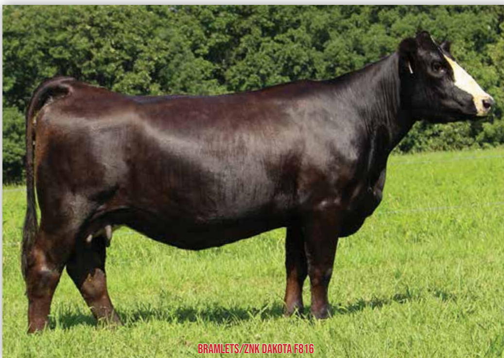
BRAMLETS/ZNK DAKOTA F816

CE 11 BW 1 WW 81 YW 119 MCE 4 Milk 24 MWW 64 Marb 0 REA 0.93 API 112