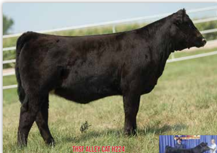
THSF ALLEY CAT H224

• Here is a female out of the high selling bull of Nate Ruby's. Currency. On the bottom side is one of the great cows in the breed, Alley 247Y and her Primo daughter 248E. Alley 248E done has done well in the show ring prior to being the high seller at the Tn. Agribition commanding a price of $43,000. Look up this April open. H224 is in the top 2 % WW and in the top 5 % for YW.