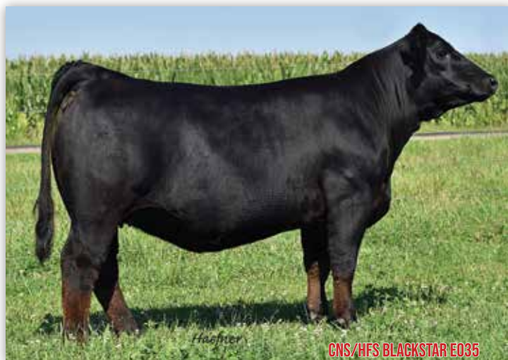
CNS/HFS BLACKSTAR E035

• Bred AI to Mr CCF Clarified E3, ASA#3275273 on 6/21/20, Due 3/30/21