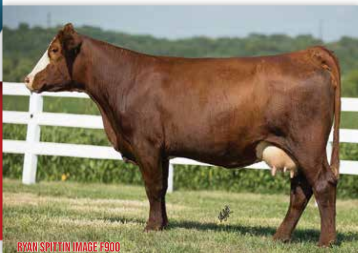
RYAN SPITTIN IMAGE F900

44A Ryan Ms. Dianna H556 | 3756653 | 3/16/20 | H556 | Heifer | 68 | HILB Collusion F1D, ASA#3756653