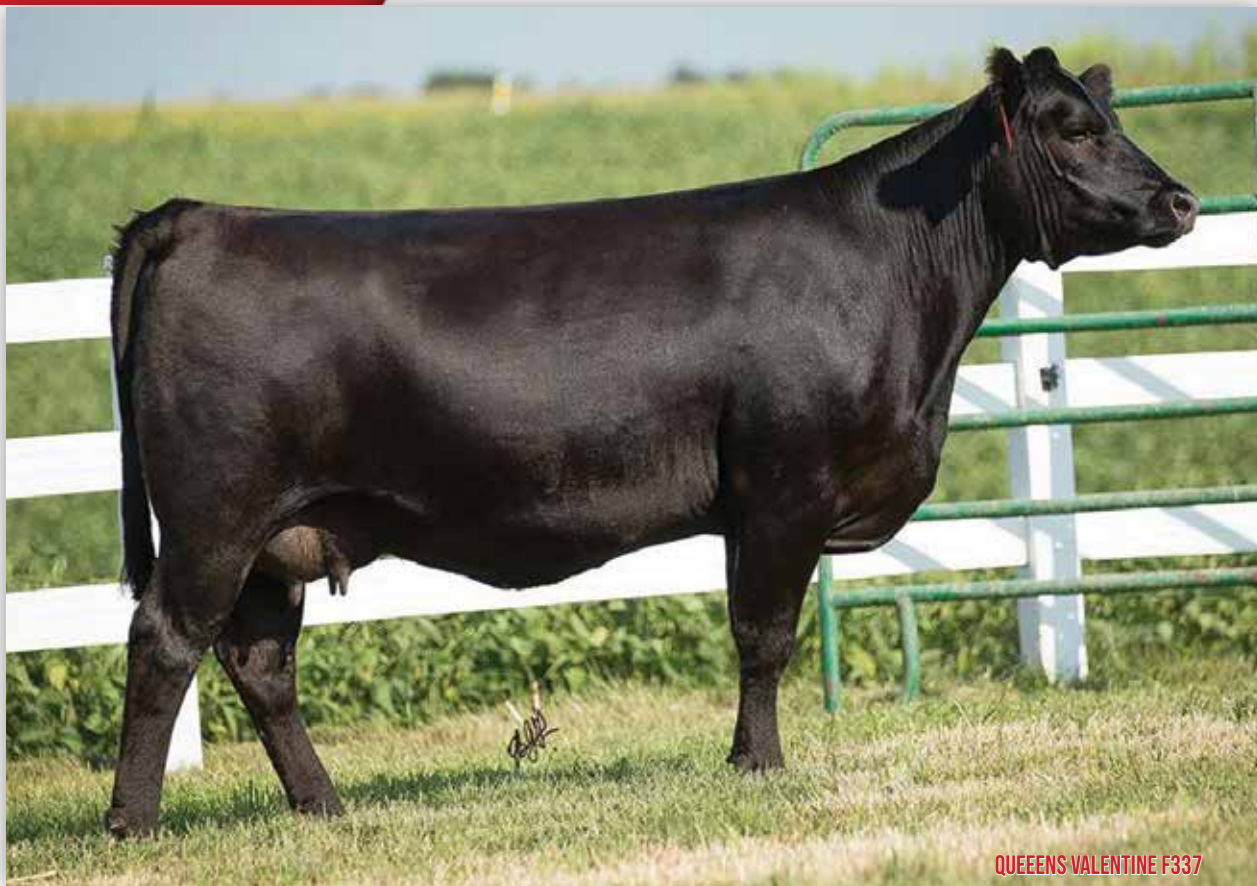
QUEENS VALENTINE F337