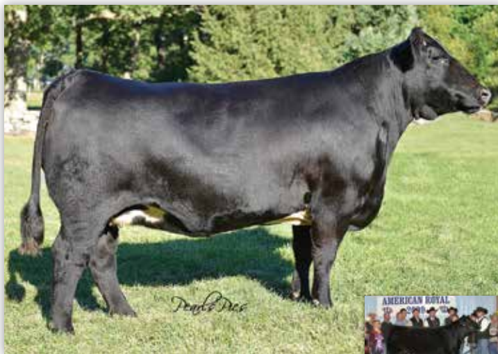
RP/MP RIGHT TO LOVE 015U - REF.