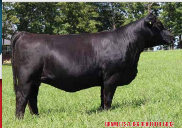
BRAMLETS/LUSK BEAUTIFUL G602