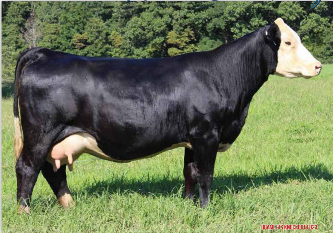
BRAMLETS KNOCKOUT F823