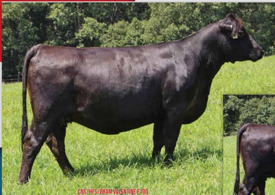
CNS/HFS/BRAM VALENTINE F100