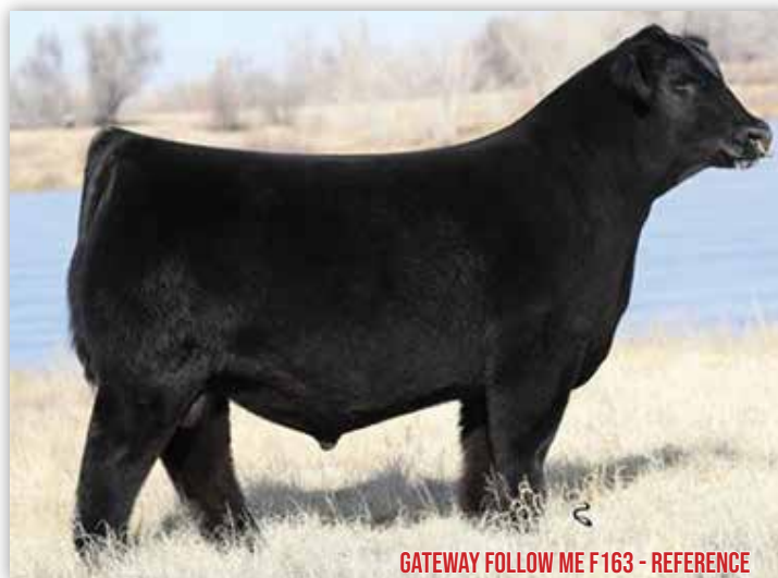
GATEWAY FOLLOW ME F163 - REFERENCE

• At the Head of the Class we offer the first pregnancy we have sold out of the Iowa State Fair division champion, THSF Miss Love B27. B27 is a full sister to B57 that was 9th overall at the AJSA Jr Nationals. With all the history, predictability, high sellers and banners this family is one of the best. The next factor is the sire we select to use is Gateway Follow Me. This wow factor Angus bull was on display at Denver and caught everyone's attention. JS has got a great one in Follow Me. This Sim Angus pregnancy is due January 2021. We believe strongly in this mating and with the Right To Love daughters in our herd, we needed to share the love.