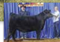
B&K ALLEY 248E - REF. DAM