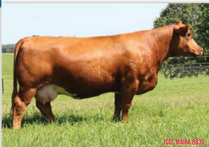
TCCC MAIRA D830

• Pasture Exposed to Volk Direct Order, ASA#3282484 from 11/20/19 to 1/1/20. Safe in calf.