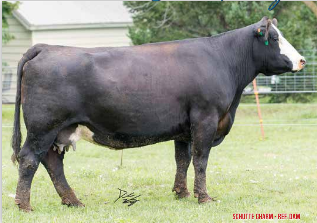
SCHUTTE CHARM - REF. DAM