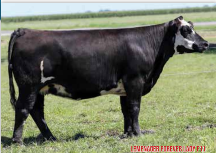
LEMENAGER FOREVER LADY F11

CE 13 BW 0.4 WW 73 YW 109 MCE 8 Milk 24 MWW 60 Marb 0.22 REA 0.22 API 122