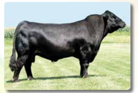
CNS Dream On L186 - reference