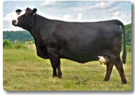
WLE Crocus U56 - reference granddam