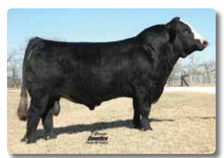
SVF NJC Built Right - reference