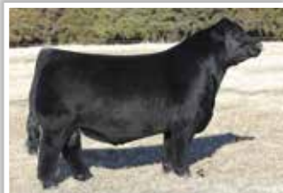
JSUL Something About Mary - ref. sire