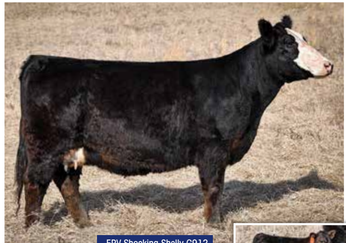
ERV Shocking Shelly G912

2A ERV Hall Pass K214 • ASA#4020653 • 2/22/22 • Bull • BW: 78 lbs • Tattoo: K214 • Sire: W/C Password 28E, ASA#3336324 consignor: ERV Cattle