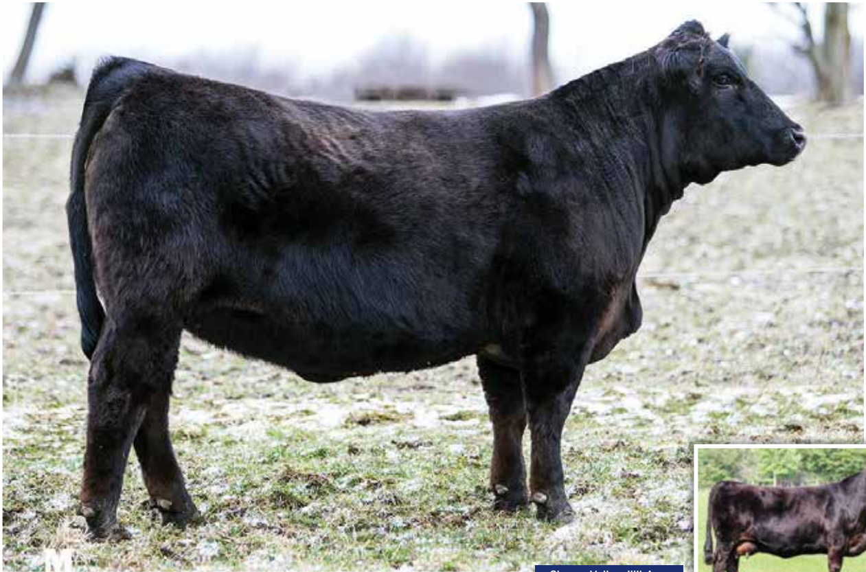
Simme Valley Jillii-Anna