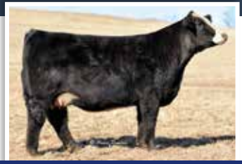
SSC Miss Cool Butt 26A - reference