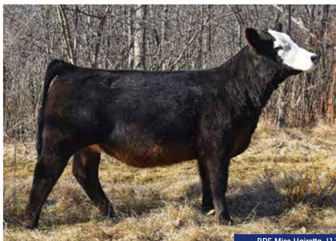
BPF Miss Hairietta J11