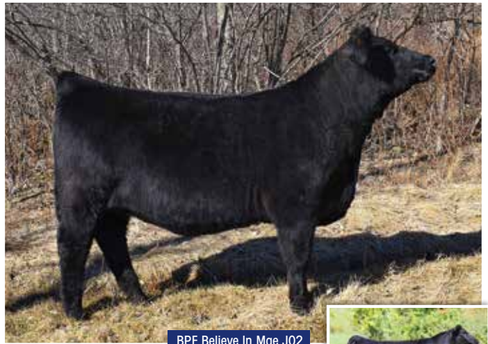
BPF Believe In Mae J02