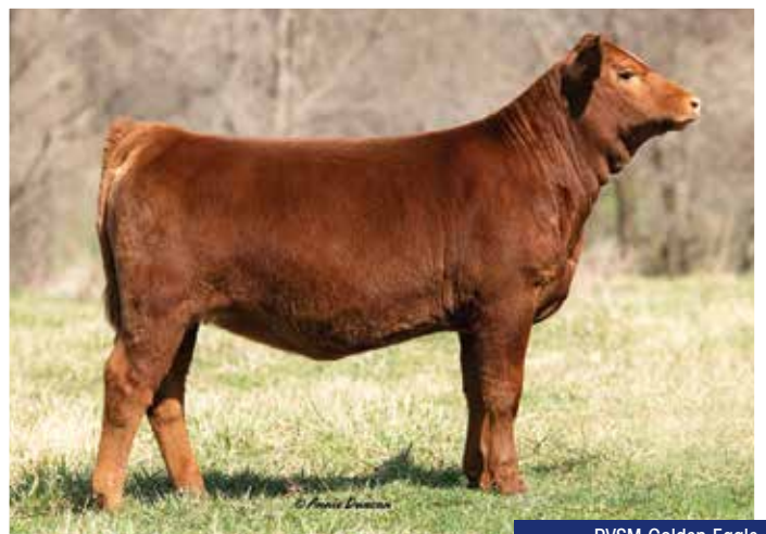
PVSM Golden Eagle