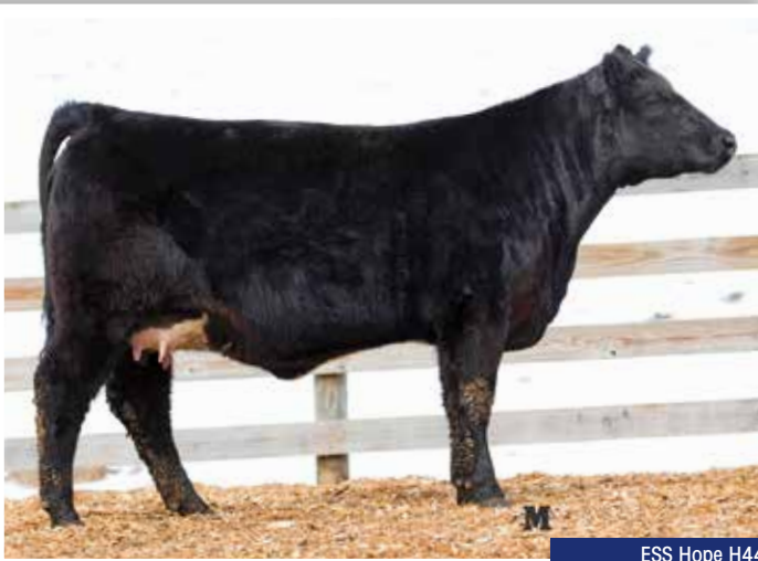
ESS Hope H44