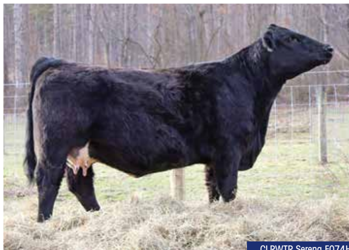
CLRWTR Serena F074H