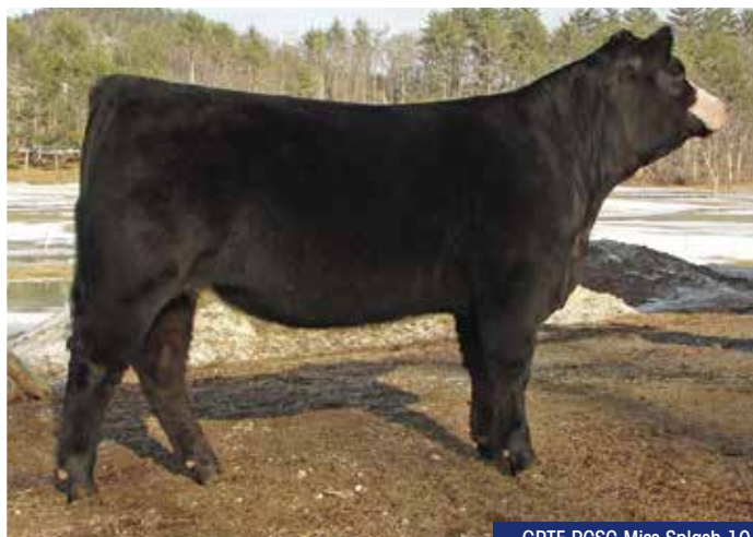
GRTF PCSC Miss Splash 10J