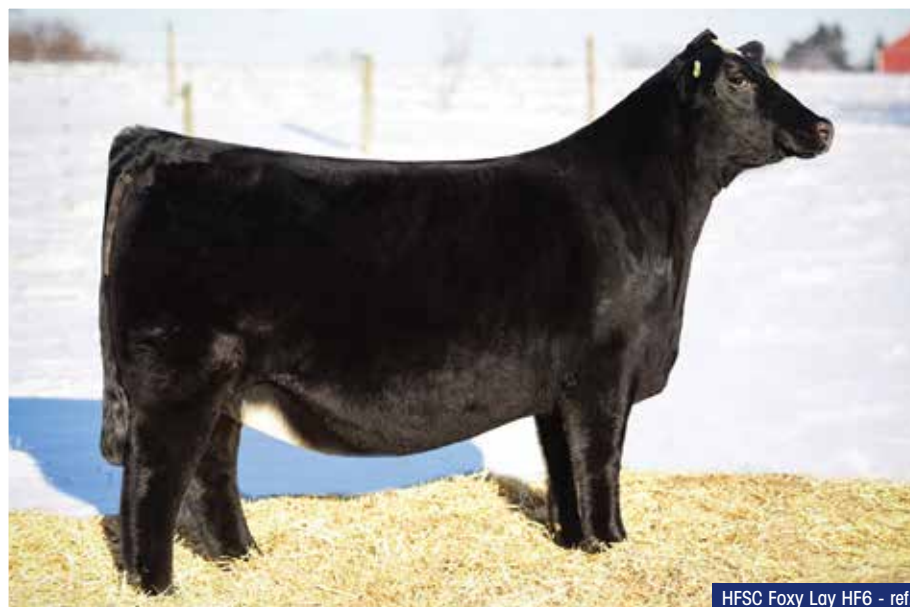
HFSC Foxy Lay HF6 - ref.