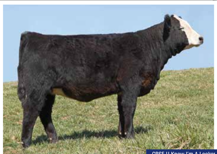
CBSF U Know I'm A Looker