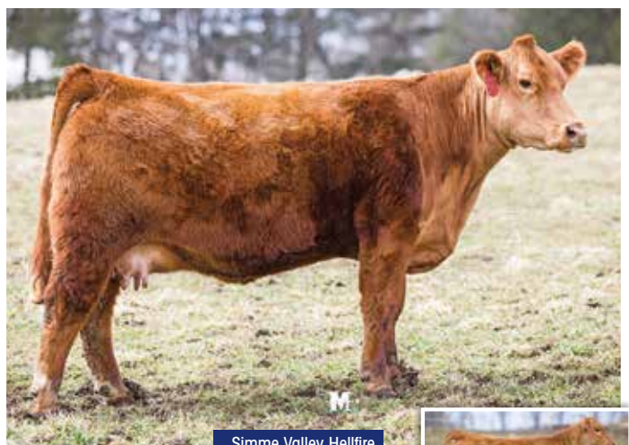
Simme Valley Hellfire