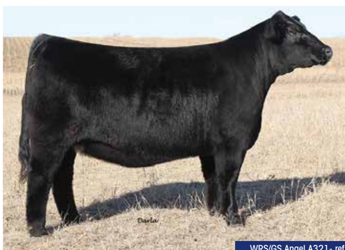
WRS/GS Angel A321 - ref.