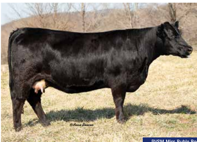
PVSM Miss Bumble Bee