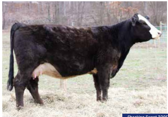
Shocking Secret 320F

3A GRSM Splashy Secret 21K • ASA#4021095 • 1/2/22 • Heifer • BW: 86 lbs • Tattoo: 21K • Sire: Geff County O, ASA#3289219 consignor: Green Ridge Farm