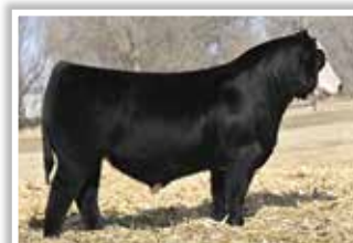
W/C Bank On It 273H - ref. sire