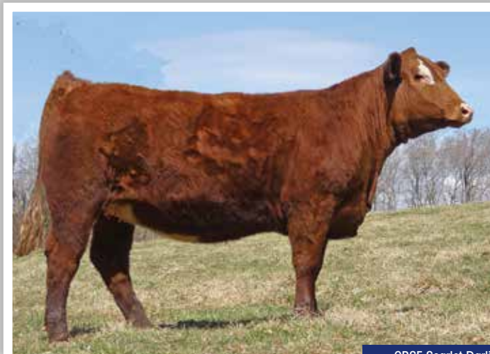
CBSF Scarlet Darlin'