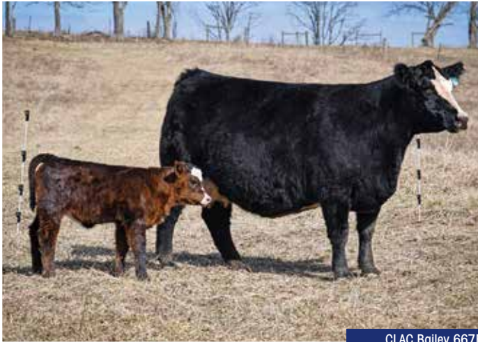
CLAC Bailey 667E