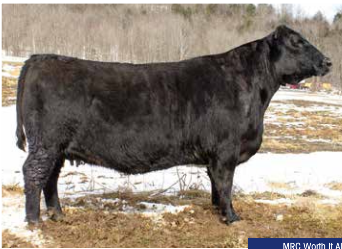
MRC Worth It All

pasture exposed to OEF Made in America H17, ASA#374866 on 12/8/21 consignor: On The Edge Farm