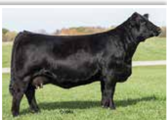
HF Serena - reference dam