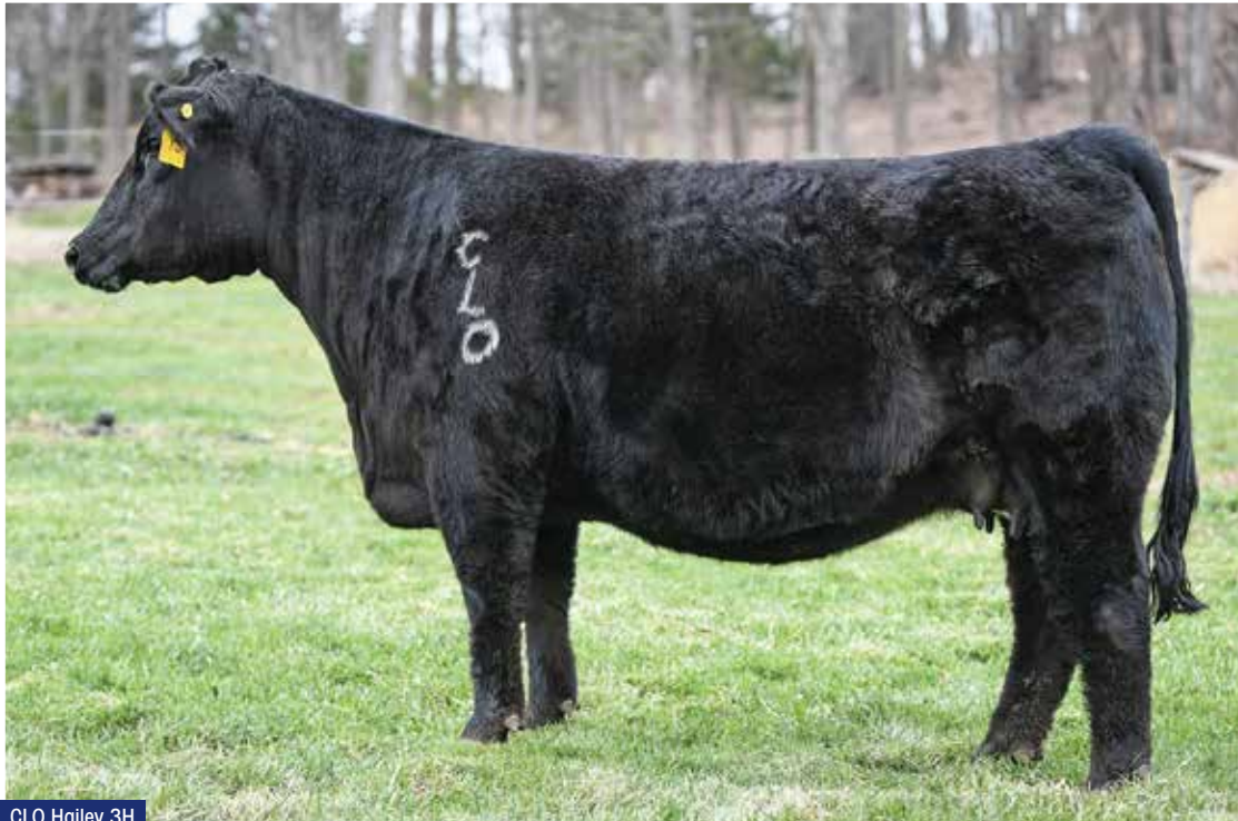
CLO Hailey 3H