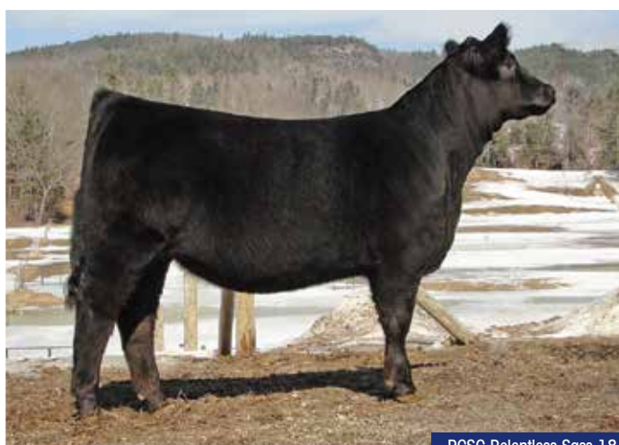
PCSC Relentless Sass 18J