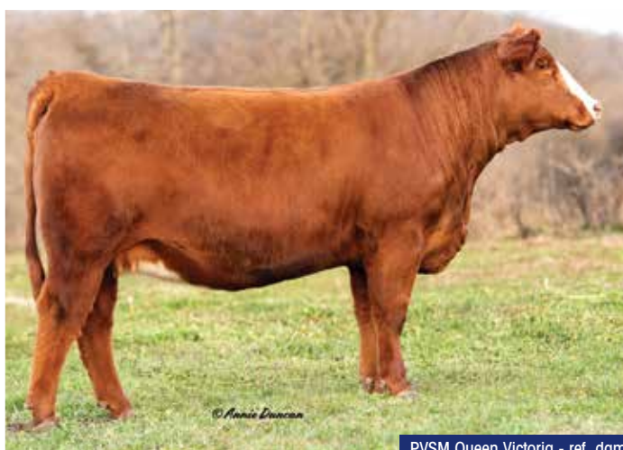
PVSM Queen Victoria - ref. dam