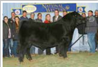
TJSC Hammer Time - ref. sire