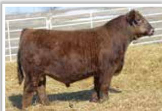
KBHR Sniper E036 - ref. sire