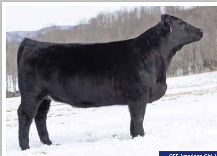
OEF American Girl J5