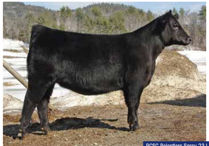
PCSC Relentless Sassy 23J