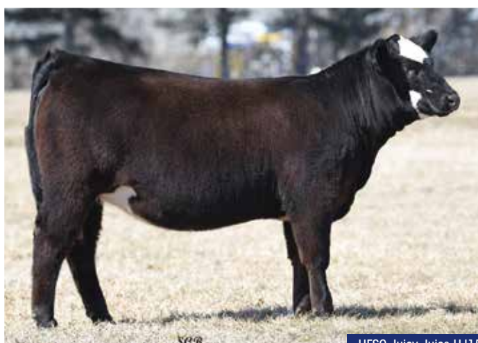
HFSC Juicy Juice HJ15