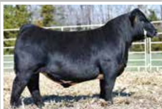
W/C Bankroll 1199F - reference sire Lot 10A