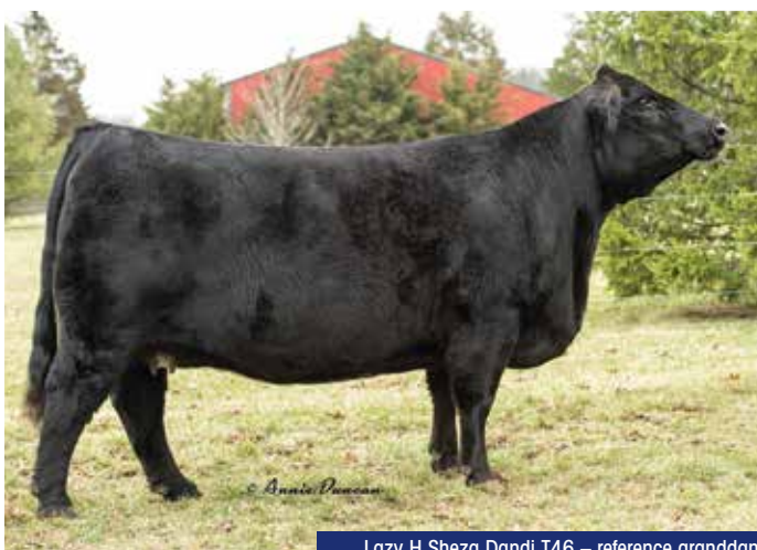
Lazy H Sheza Dandi T46 - reference granddam