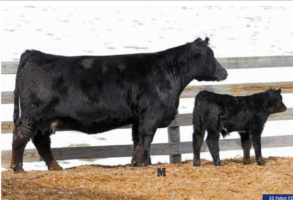
ES Fallon F23