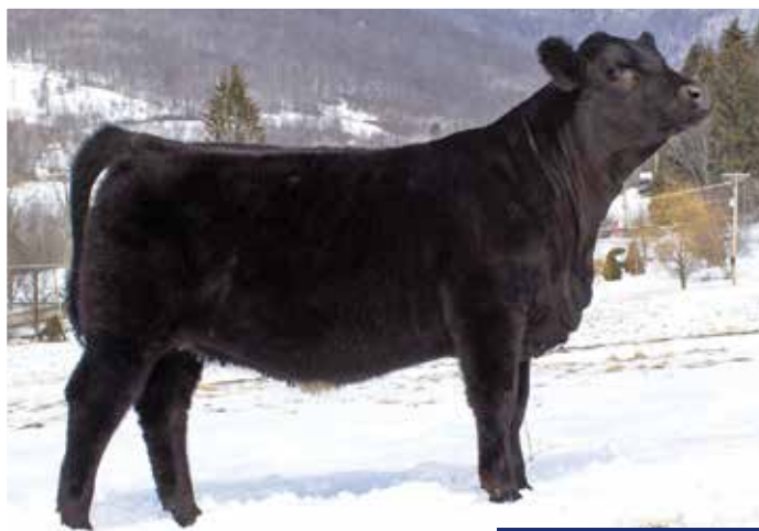
OEF Chipp`n In J25