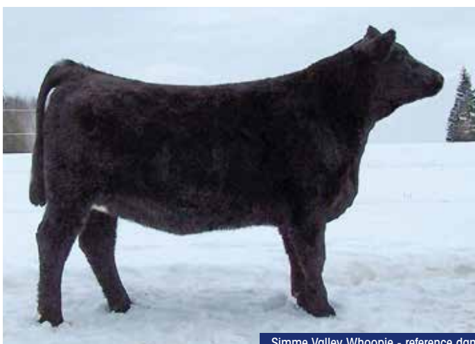
Simme Valley Whoopie - reference dam