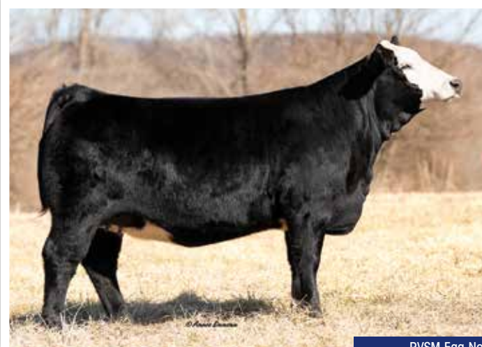
PVSM Egg Nog