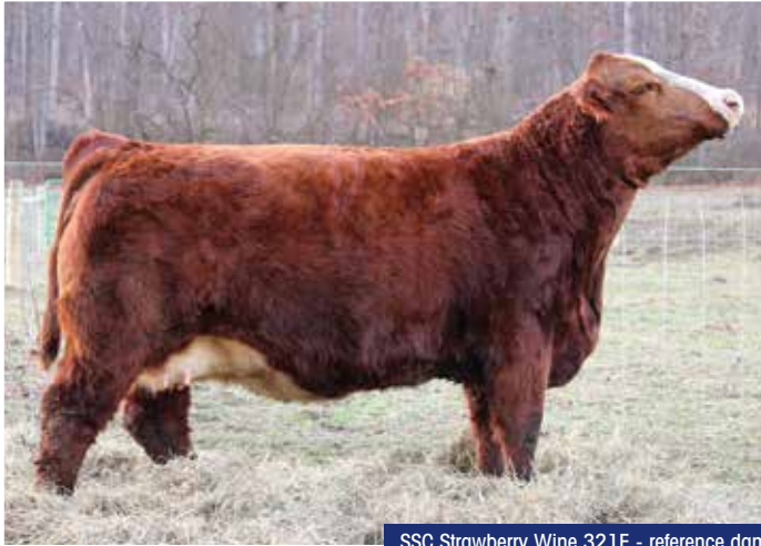
SSC Strawberry Wine 321E - reference dam