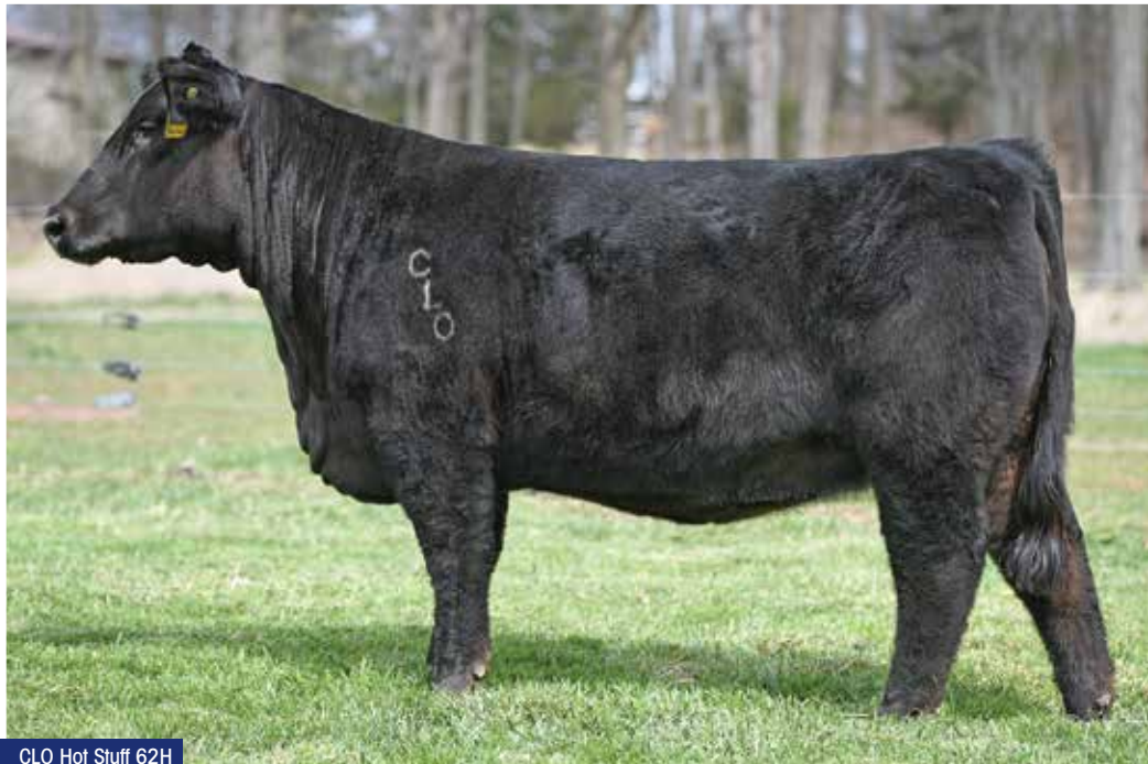
CLO Hot Stuff 62H