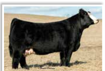
SSC Victoria's Secret 49B - reference