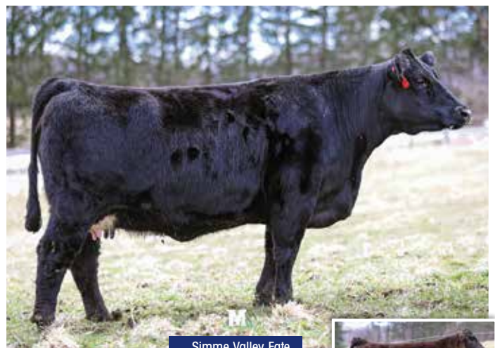
Simme Valley Fate