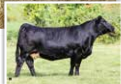
BPF Daisy Mae F01 - reference dam