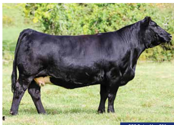
BPF Daisy Mae F01 - ref.