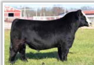
HILB Oracle C033R - ref. sire