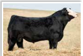
SSC Shell Shocked - reference