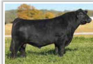
W/C Relentless 32C - ref. sire