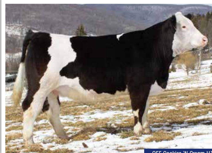
OEF Cookies 'N Cream H19