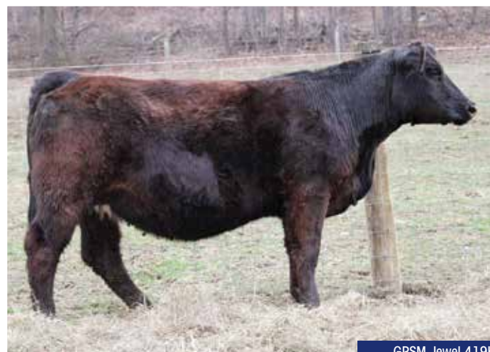
GRSM Jewel 419H