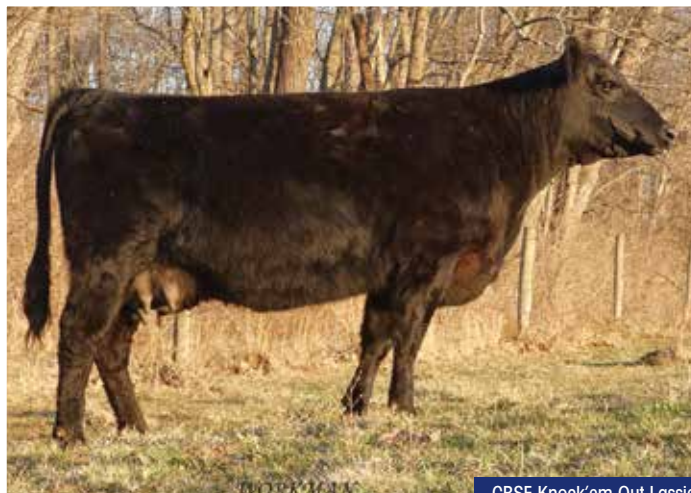
CBSF Knock'em Out Lassie