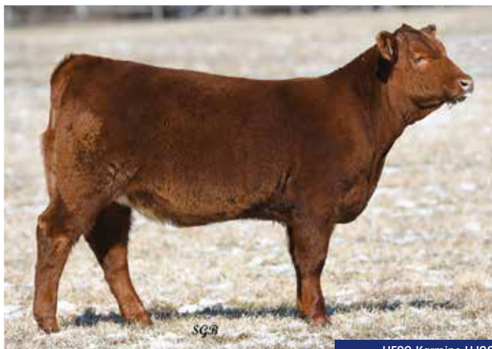
HFSC Karmine HJ28