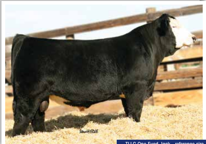
TLLC One Eyed Jack - reference sire