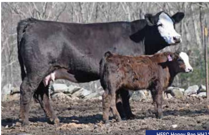
HFSC Honey Bee HH12