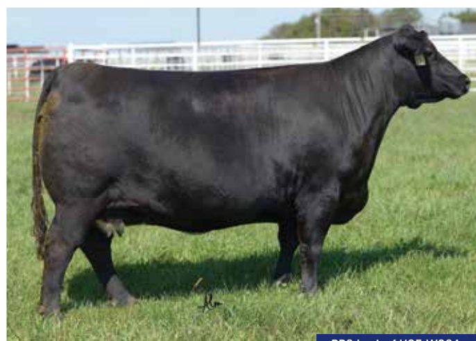
PRS Look of H25 W264 - ref.