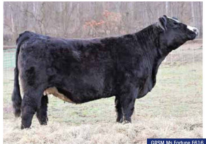
GRSM Ms Fortune F616