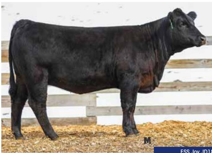
ESS Joy JD18