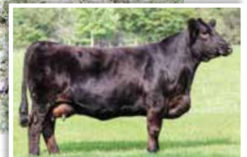
Simme Valley Fre-Anna - reference dam