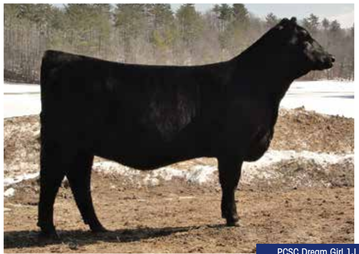
PCSC Dream Girl 1J