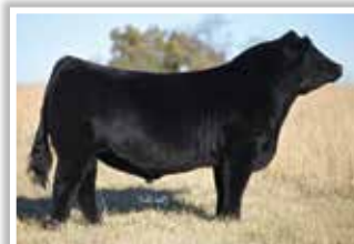
LLSF Pays To Believe - ref. sire