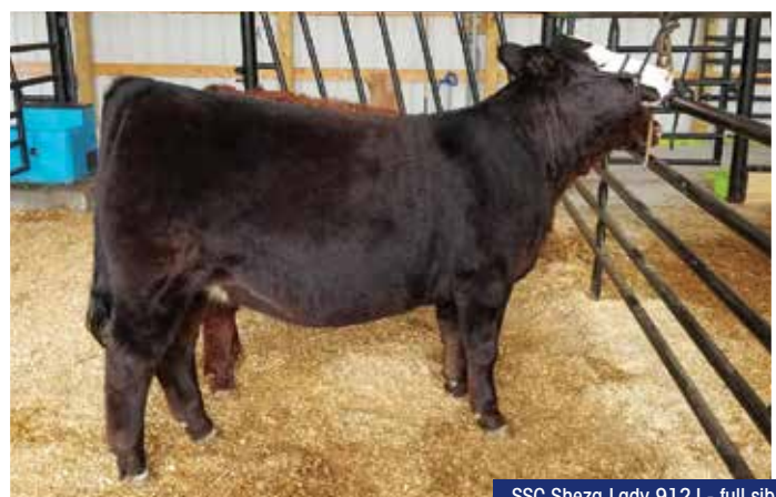
SSC Sheza Lady 912J - full sib