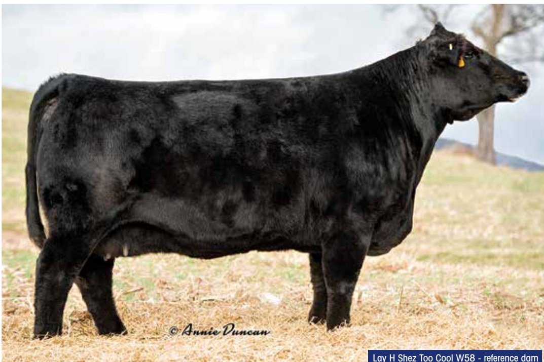
Lazy H Shez Too Cool W58 - reference dam