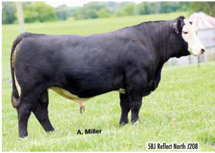
5BJ Reflect North J208