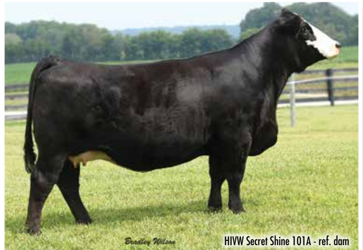
HLW Secret Shine 101A - ref. dam