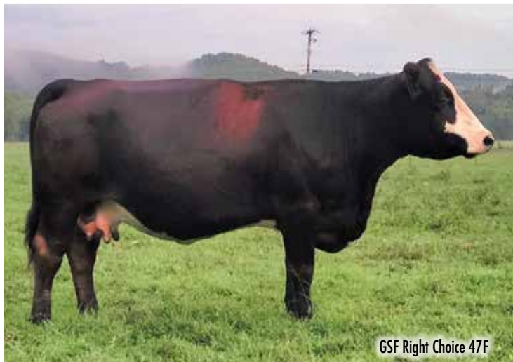
GSF Right Choice 47F