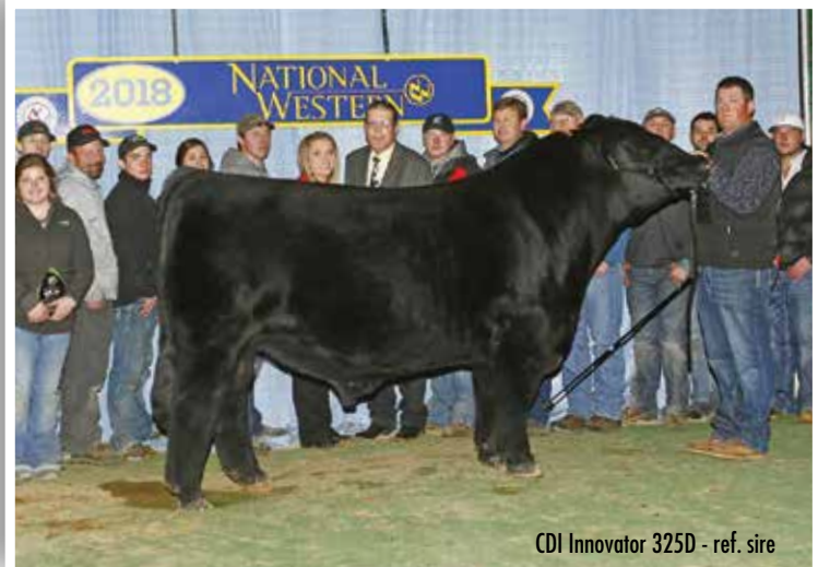
CDI Innovator 325D - ref. sire