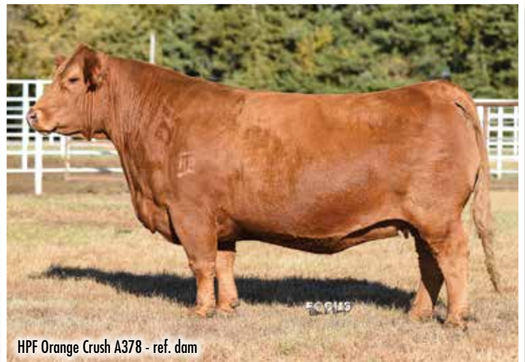
HPF Orange Crush A378 - ref. dam