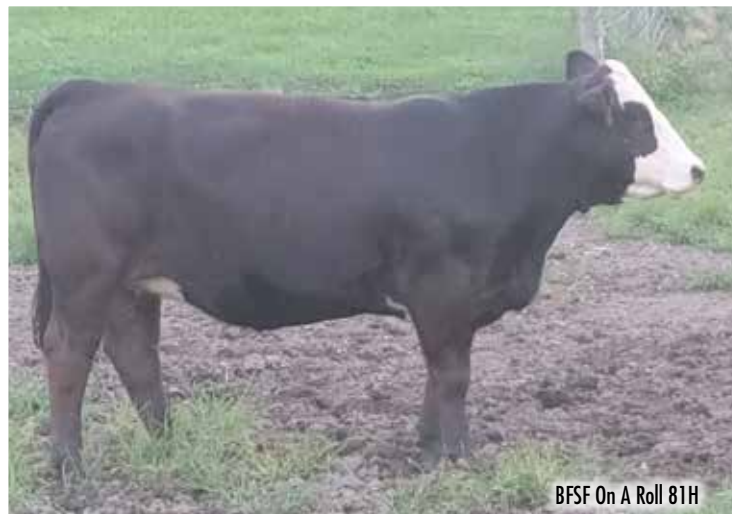
BFSF On A Roll 81H