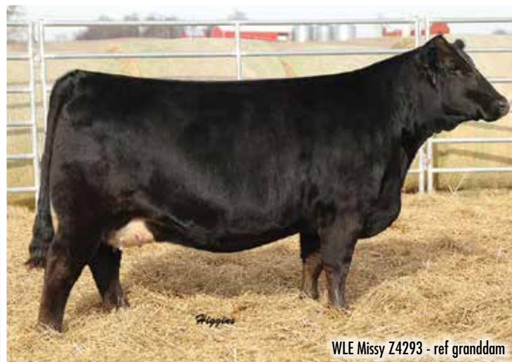
WLE Missy Z4293 - ref granddam