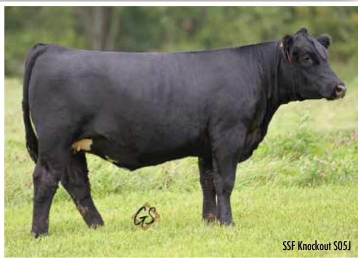
SSF Knockout S05J