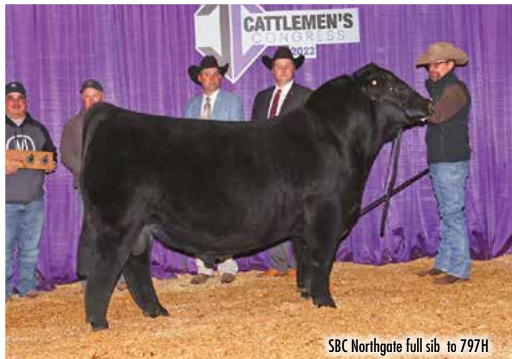
SBC Northgate full sib to 797H