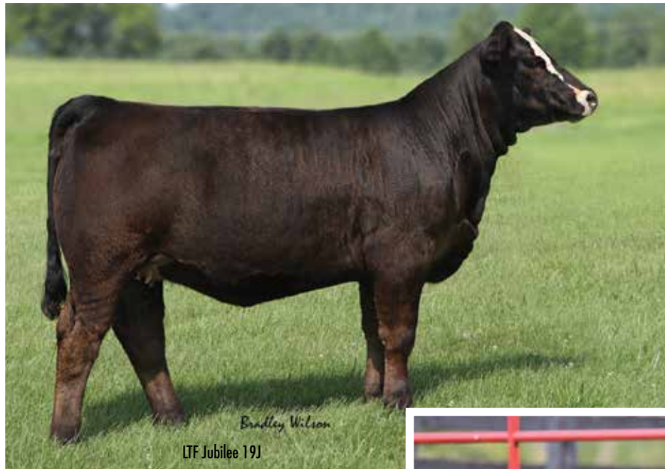
LTF Jubilee 19J