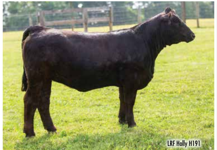
LRF Holly H191