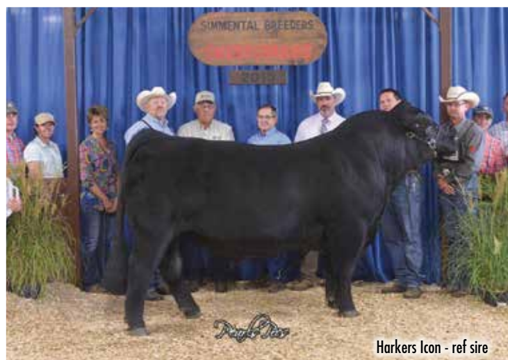
Harkers Icon - ref sire