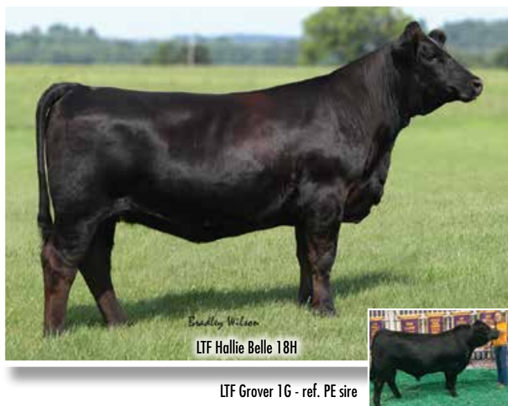
LTF Grover 1G - ref. PE sire