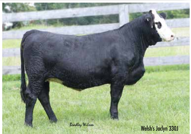
Welsh's Jaclyn 330J