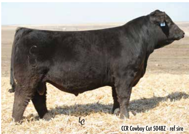
CCR Cowboy Cut 5048Z - ref sire