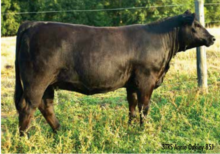
3TRS Annie Oakley 85J