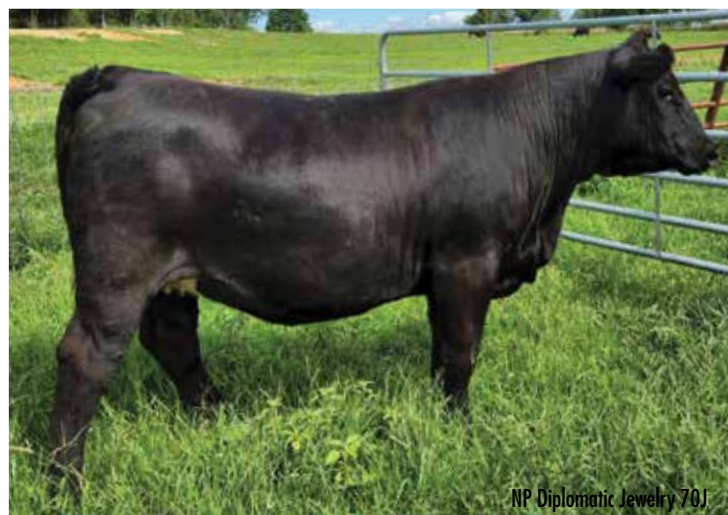
NP Diplomatic Jewelry 70J