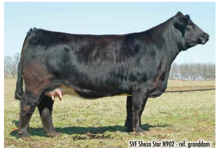
SVF Sheza Star N902 - ref. granddam