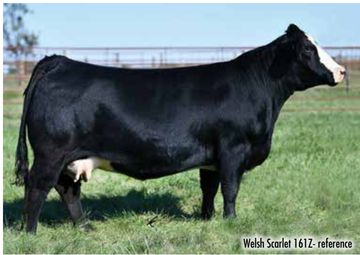
Welsh Scarlet 161Z- reference