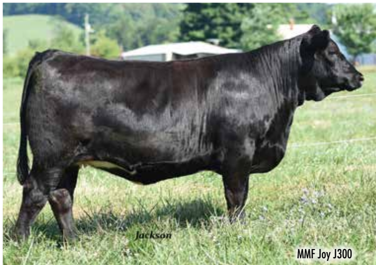
MMF Joy J300