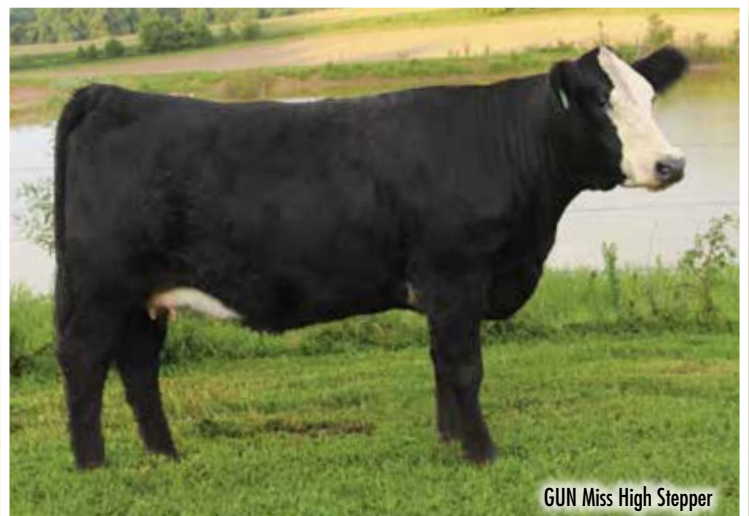
GUN Miss High Stepper