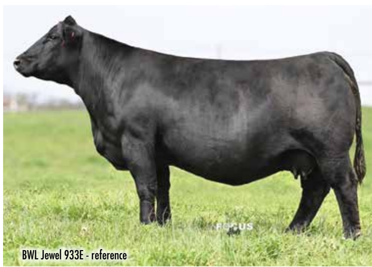
BWL Jewel 933E - reference