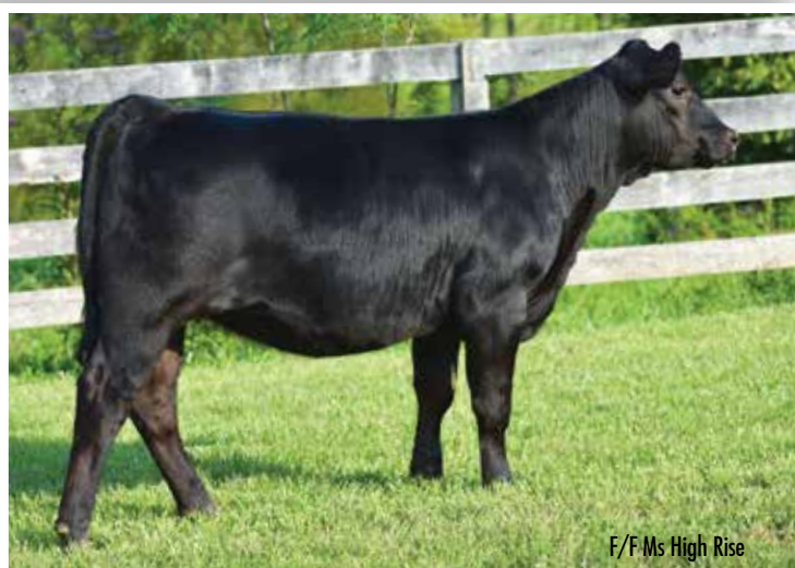
F/F Ms High Rise