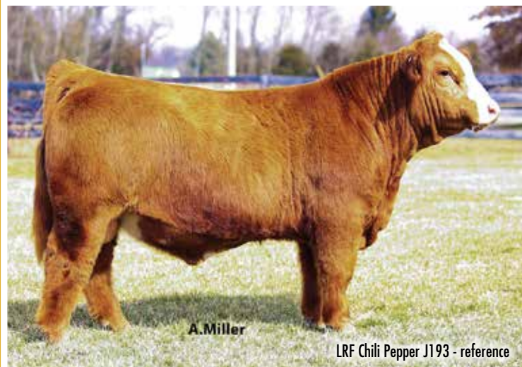
LRF Chili Pepper J193 - reference