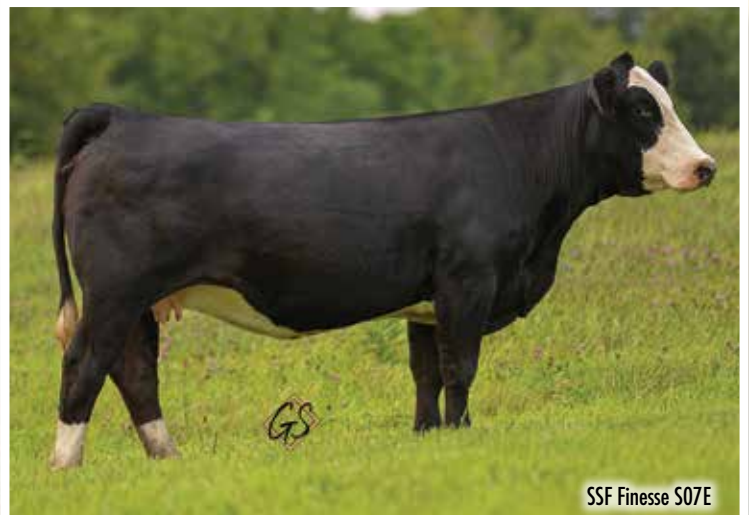
SSF Finesse S07E