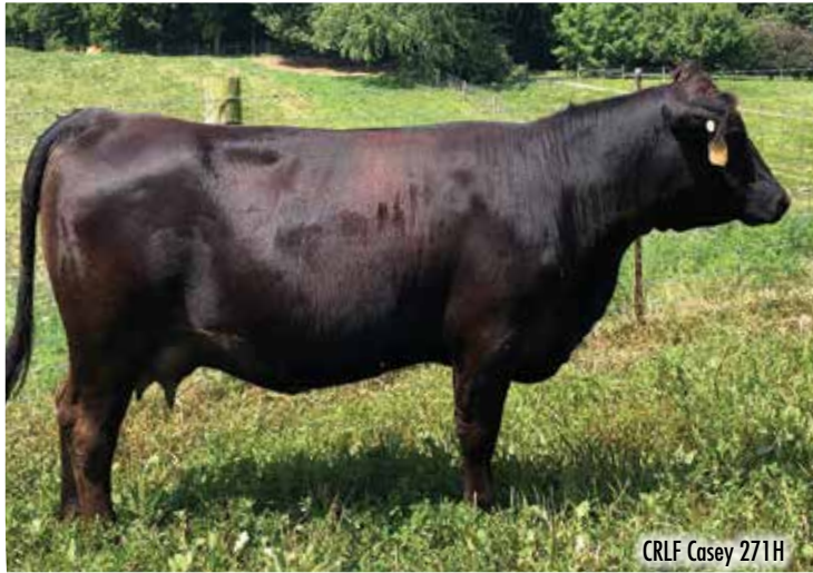
CRLF Casey 271H