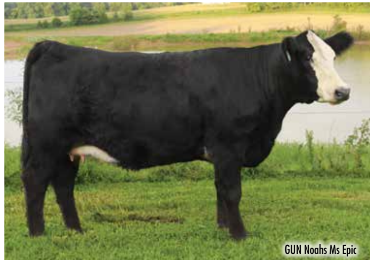
GUN Noahs Ms Epic