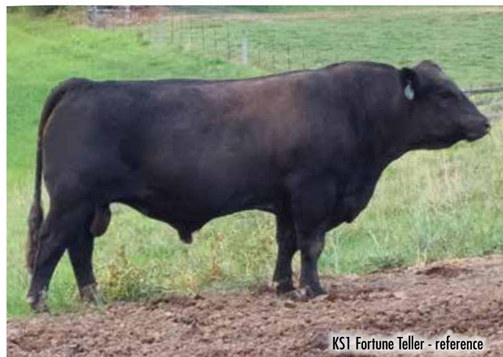
KS1 Fortune Teller - reference