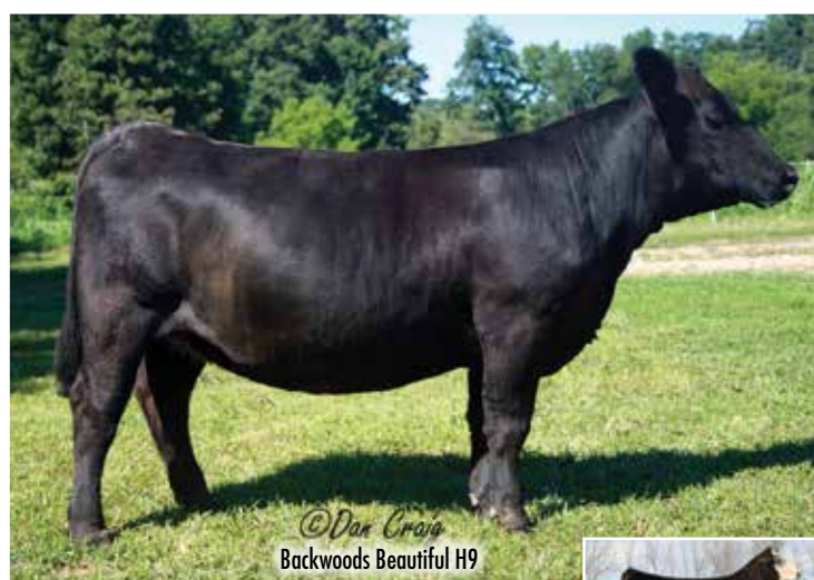
© Dan Crang Backwoods Beautiful H9