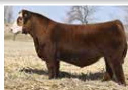
W/C Bet On Red 481H - ref.