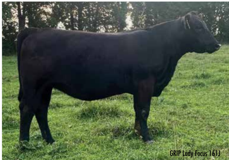
GRIP Lady Focus 161J