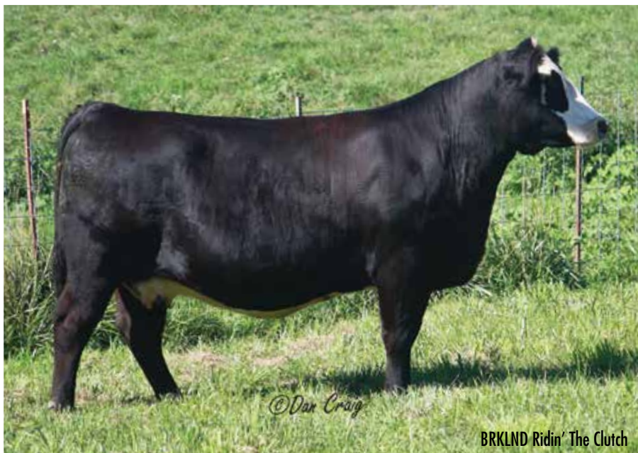
BRKLND Ridin' The Clutch