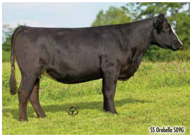
SS Orabella S09G