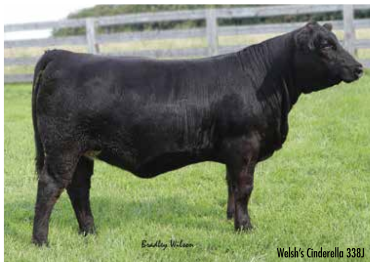
Welsh's Cinderella 338J