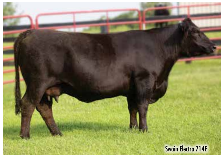
Swain Electra 714E