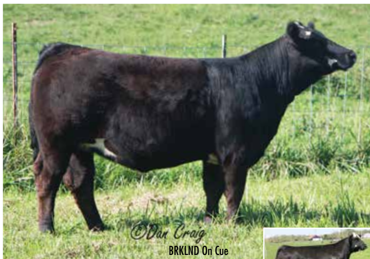
© Dan Craig BRKLND On Cue