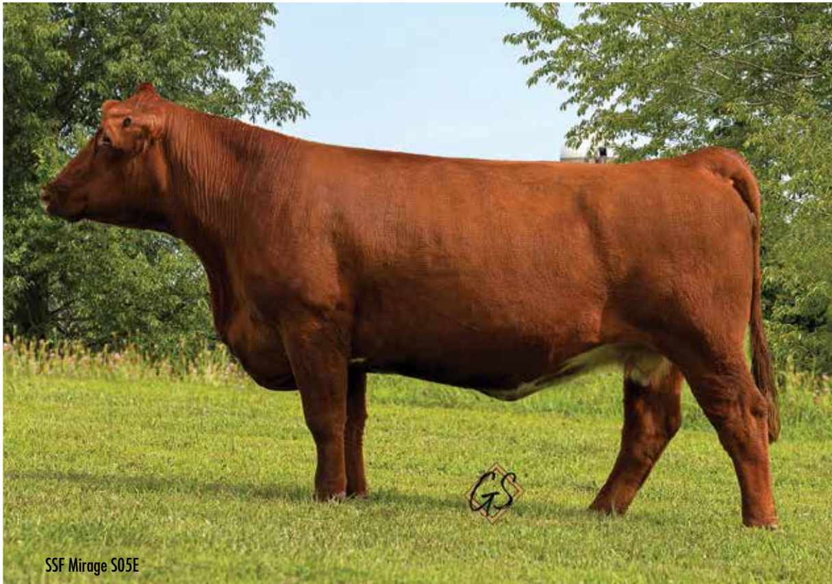
SSF Mirage S05E