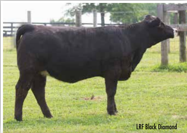
LRF Black Diamond