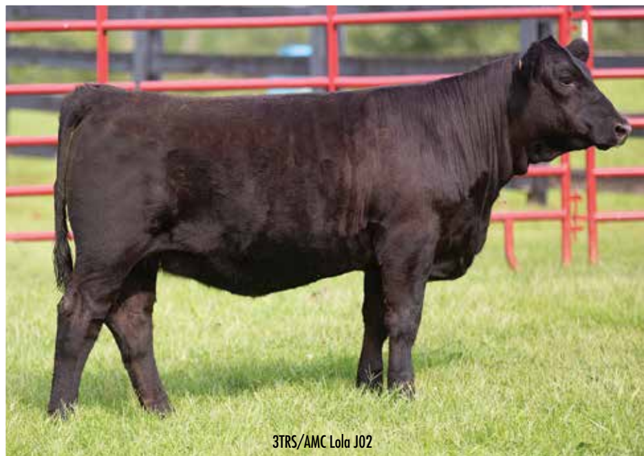
3TRS/AMC Lola J02