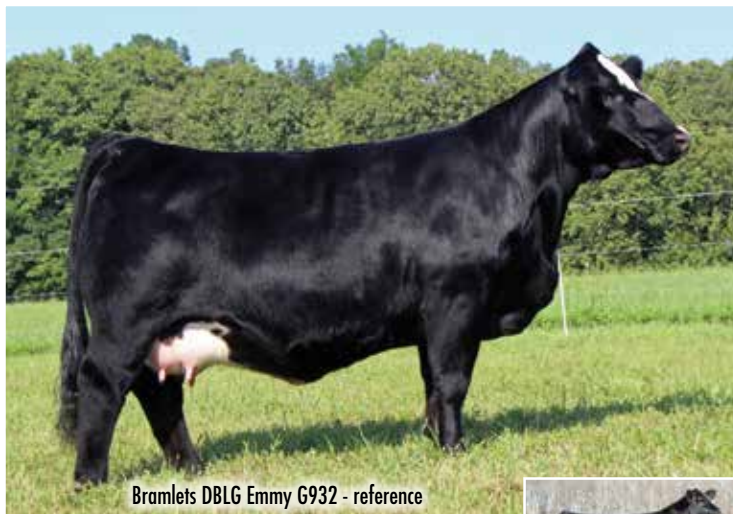
Bramlets DBLG Emmy G932 - reference

Royal B's dam is a full sister to the dam of the $45,000