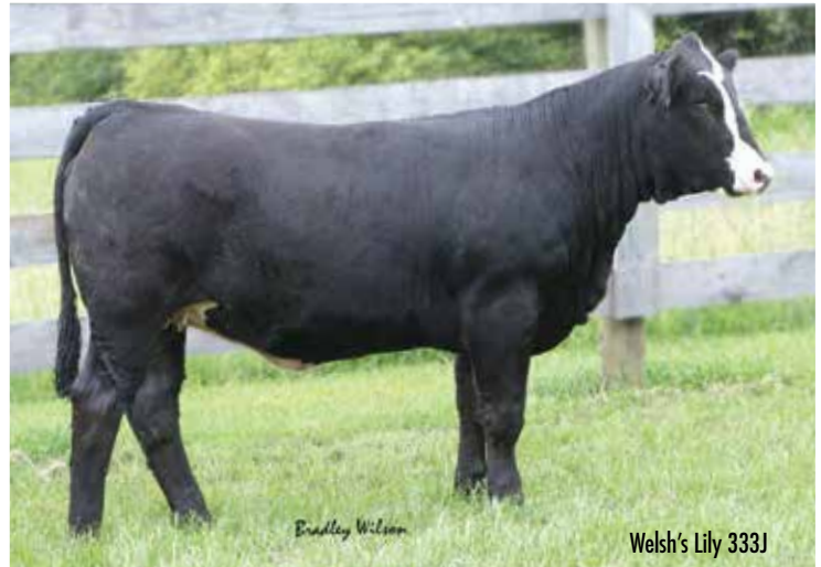
Welsh's Lily 333J