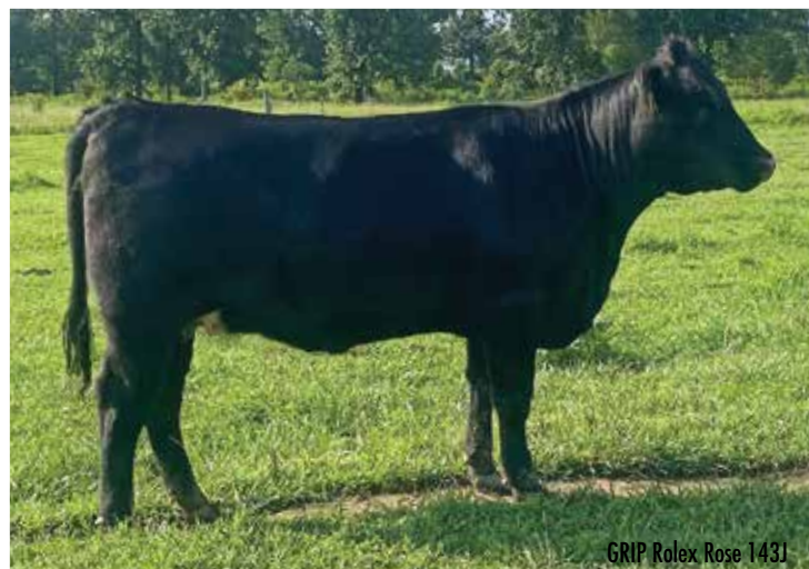
GRIP Rolex Rose 143J