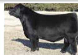
JSUL Something About Mary 8421 ref.