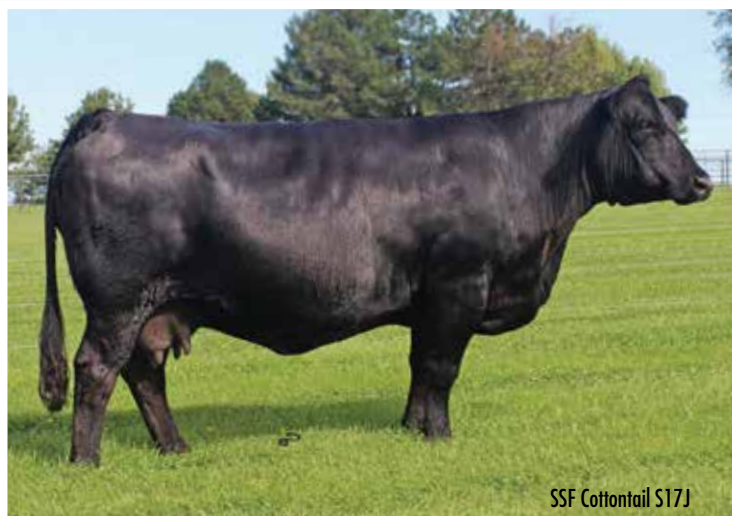
SSF Cottontail S17J