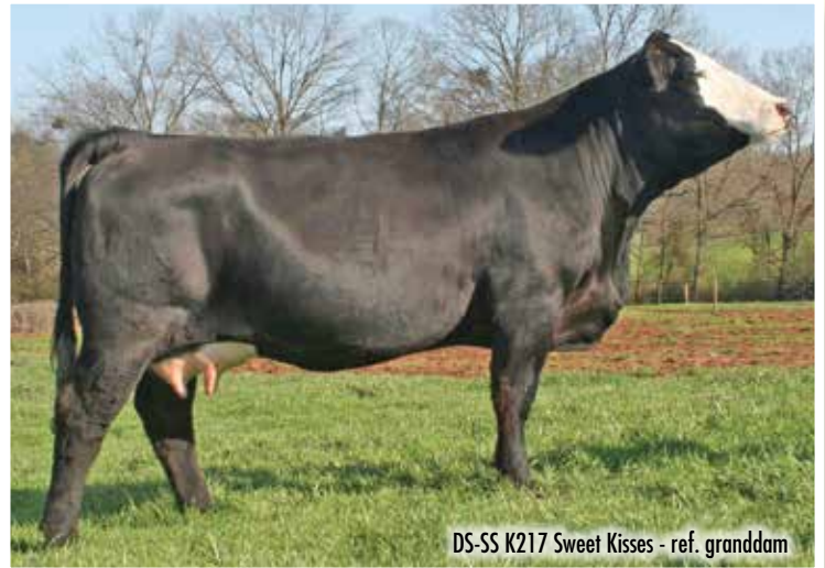
DS-SS K217 Sweet Kisses - ref. granddam