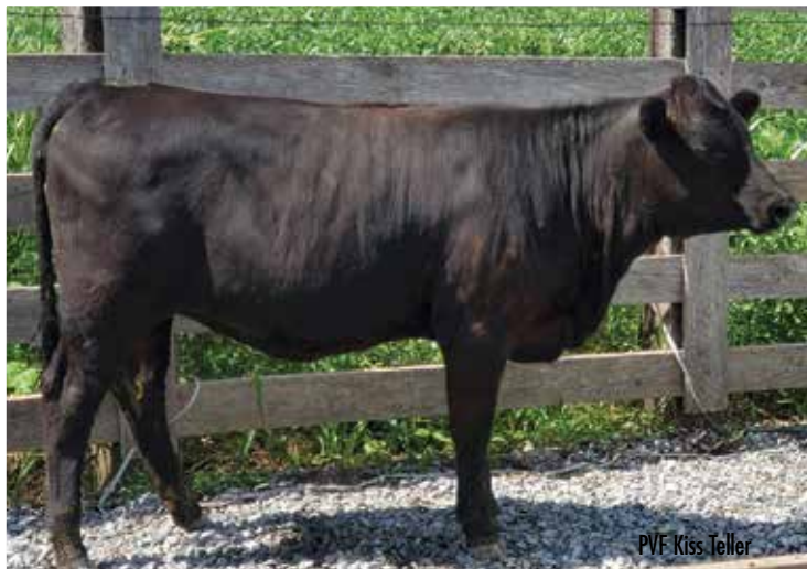
PVF Kiss Teller