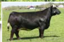
HPF Daisy Mae A008 - reference granddam