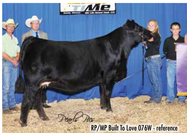
RP/MP Built to Love 076W - reference