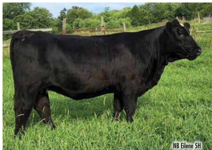
NB Eilene 5H