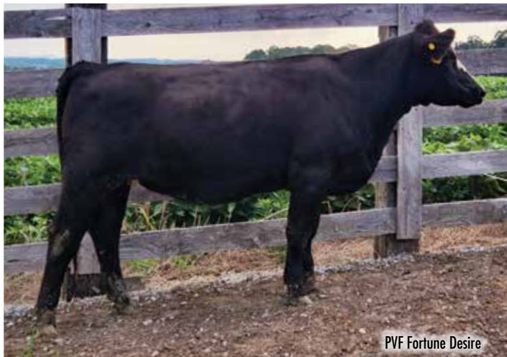
PVF Fortune Desire