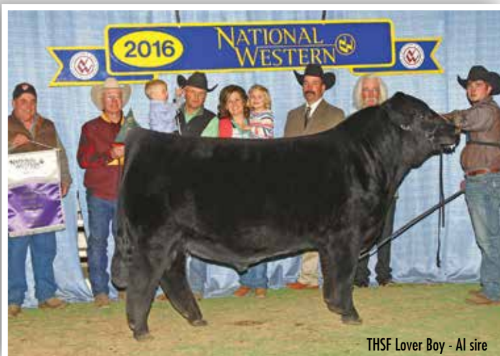
THSF Lover Boy - AI sire