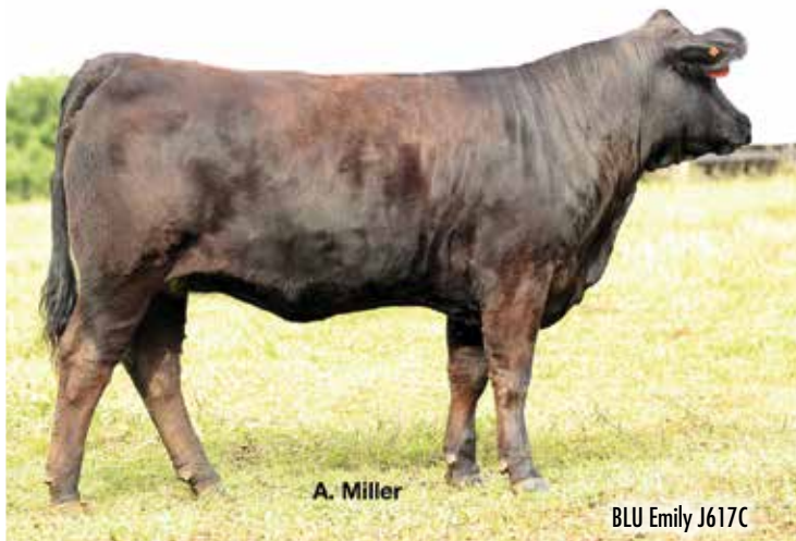
BLU Emily J617C