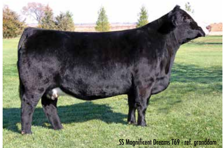
SS Magnificent Dreams T69 - ref. granddam