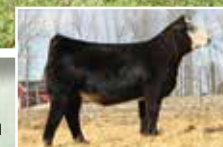
BRAM/LUSK Beautiful F110 – ref. dam