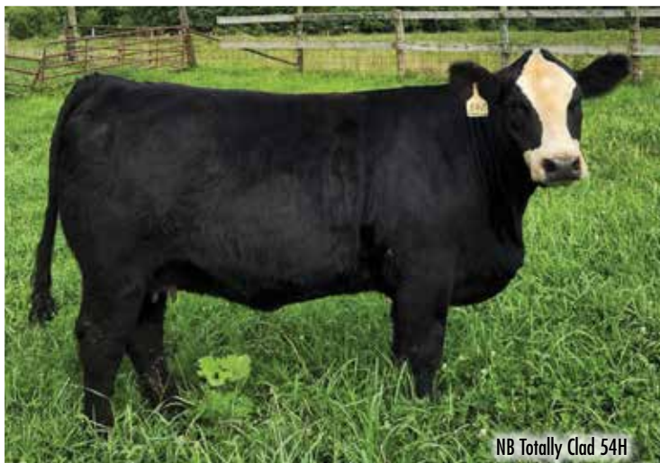
NB Totally Clad 54H