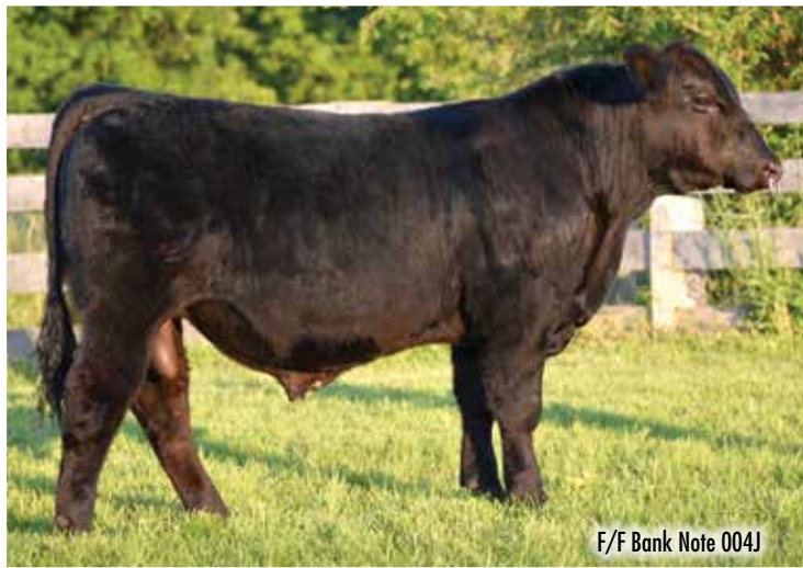
F/F Bank Note 004J