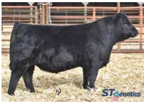
Hooks Black Hawk 50B ASA# 2854467