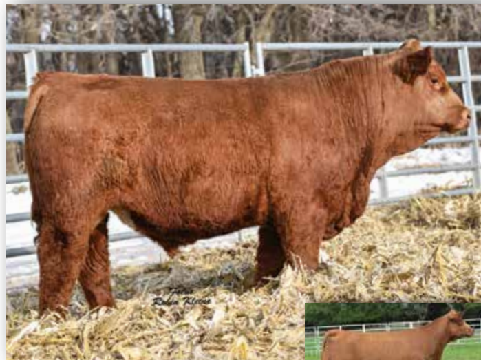
HPF Orange Crush A378 - ref. dam

E711 is royal bred being out of the long-time calving ease bull and maternal maker, ER Big Sky. On the bottom add in the performance of Milestone and Caliente. Big Crush is good hipped with a sound leg and body length. If you in the business of retaining females for the future backed by a dependable genetic line then add the Crush.