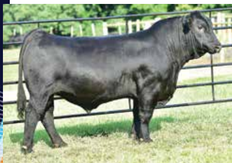
HPF Duracell D009 ASA#3124188