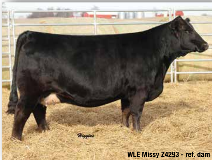
WLE Missy Z4293 - ref. dam

F197 is royally bred being out of the 20 20 and out of WLE Missy backed by Built Right and 770P. This is the youngest bull in the sale however has all the needed pedigree and more. A heifer bull.