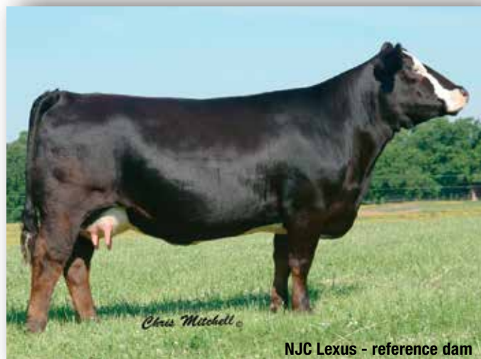
NJC Lexus - reference dam