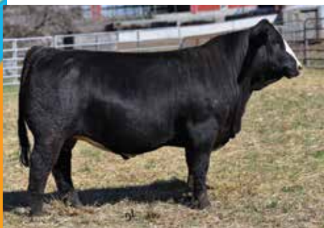
HLTS Diesel D133 ASA#3114022