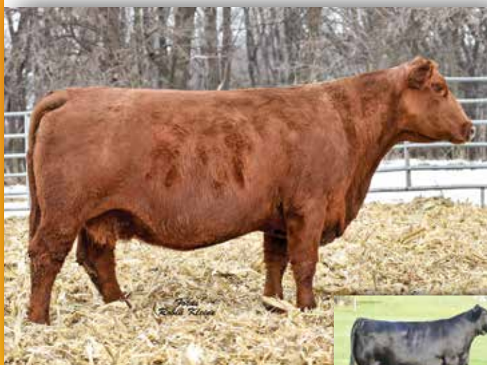
CNS Perfection R504 - ref. dam