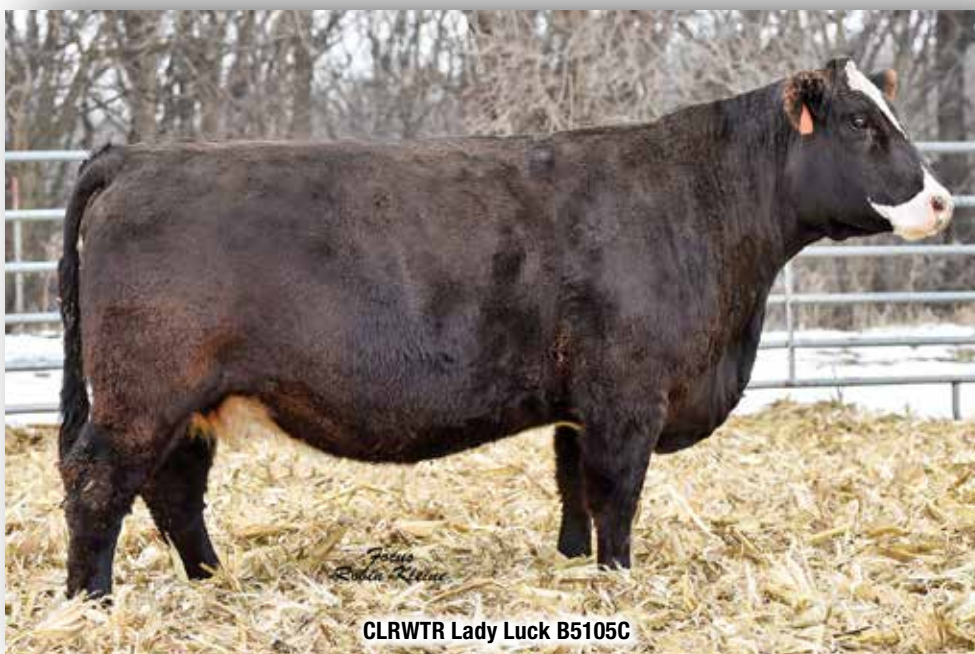
CLRWTR Lady Luck B5105C

Ald to SVS Badlands, ASA#2947416 on 2/25/18