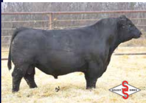
TJ Main Event ASA#2891336