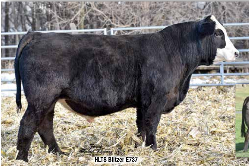
HLTS Blitzer E737

Blitzer E737 is a baldie that will be noticed because of his eye appeal and overall style. You don't see many baldie bulls sired by All Around. E737 is loaded up with shape in his top and rear end. This bull gets around good and should be able to cover some ground. Blitzer dam is the Misti donor that continues to excel in our program. Her track history has been great for outfits such as Sloup, Hudson Pines and Lazy H. Study what this bull has to offer on paper, combined with the genetic merit.