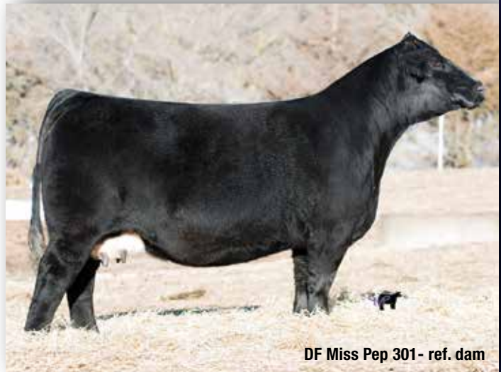
DF Miss Pep 301 - ref. dam