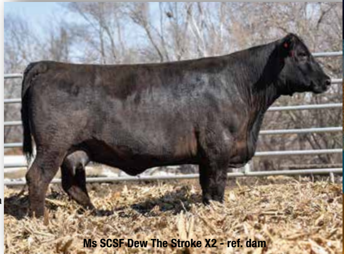
Ms SCSF Dew The Stroke X2 - ref. dam

Out of the donor Dew The Stroke X2. This Built Right x Dew The Stroke donor is a half sister to the C & C Farms and Hartman Cattle Co. 20 20 which has some of the top progeny of all the sire groups in the breed. We feel this mating to the Denver Champion Innovator will click and produce a good one. The donor X2 is the same trusted family that produced In Dew Time and Duracell. This will work because predictability is built in and bred in.