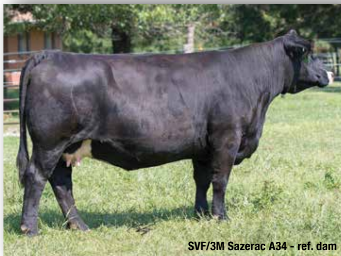
SVF/3M Sazerac A34 - ref. dam

Here is one of the younger bulls in the offering however combines two great cow families of Black Blaze and Sazerac. Load Up here.