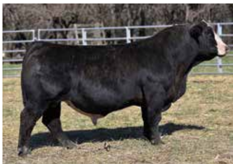
SS Watchout A296 ASA#32810493