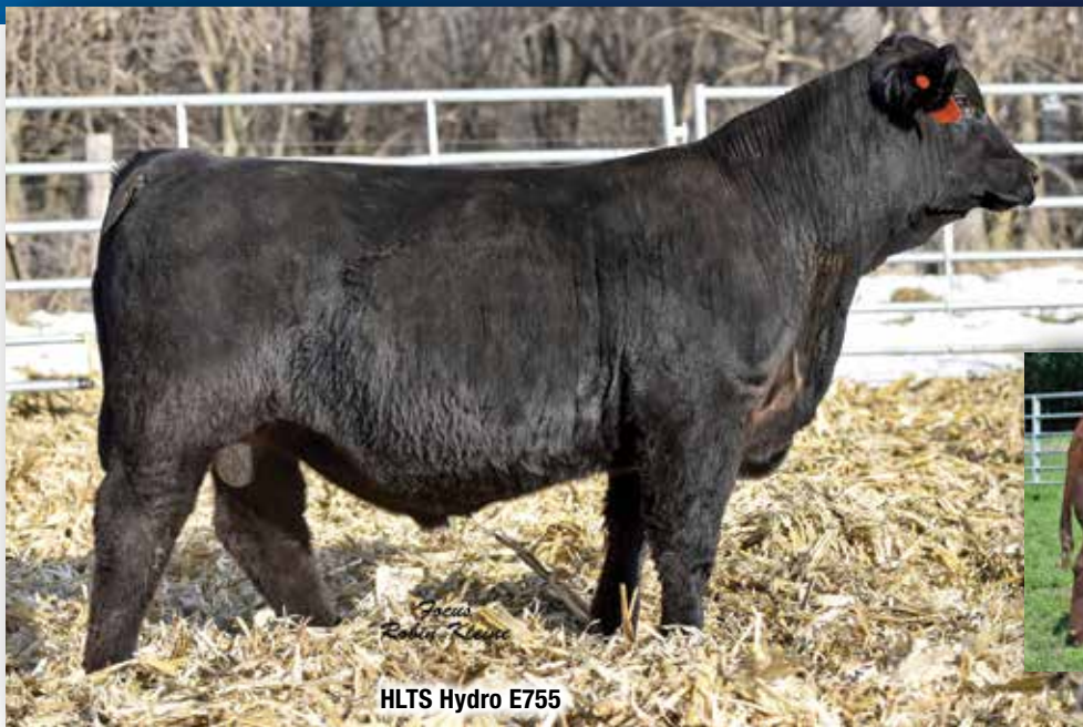
HLTS Hydro E755