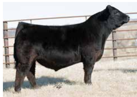
WS Emergent E715 ASA#3280609