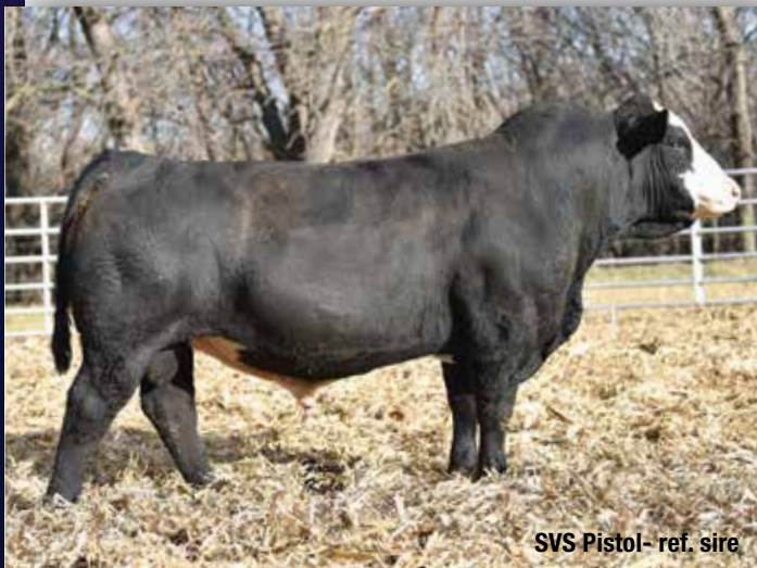
SVS Pistol- ref. sire