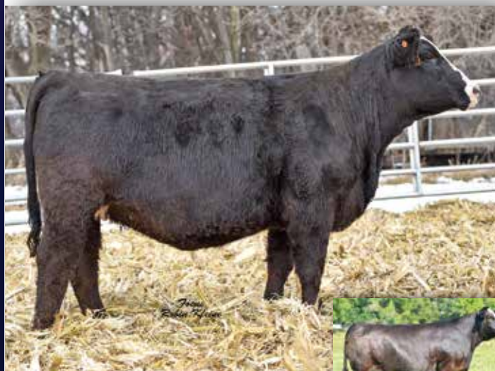
PRS Spring Velvet X126- ref. dam

Ald to LCDR American Outlaw, ASA#3287017 on 2/25/18