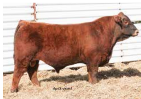
CHSR Sniper 30D ASA#3160876

We are excited to have some of the breed's leading sires roaming our pastures... Contact us today for your semen needs!