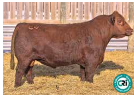
CDI RimRock 325Z ASA#2700121