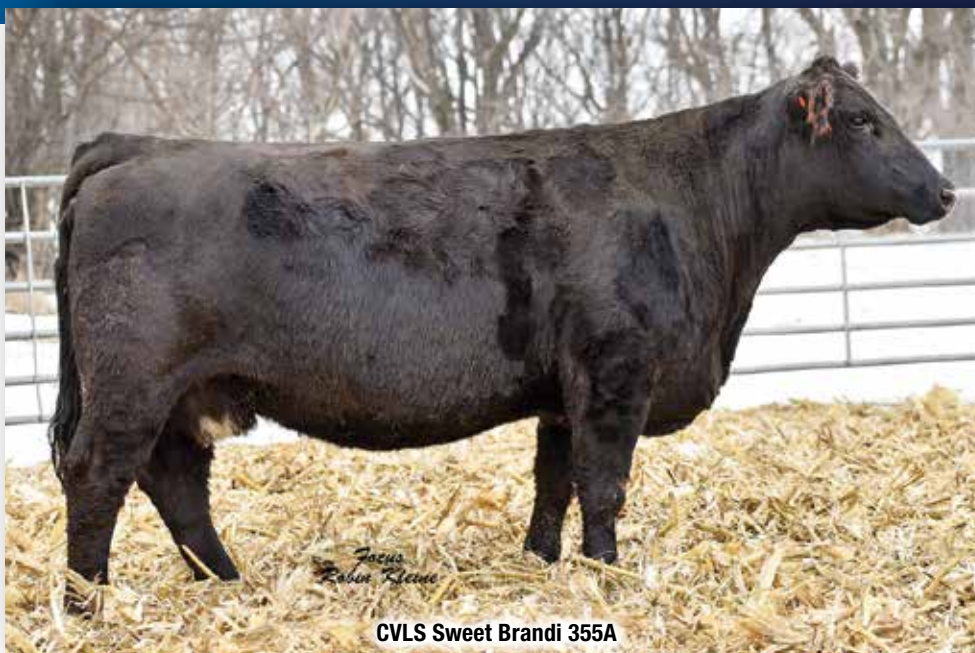
CVLS Sweet Brandi 355A