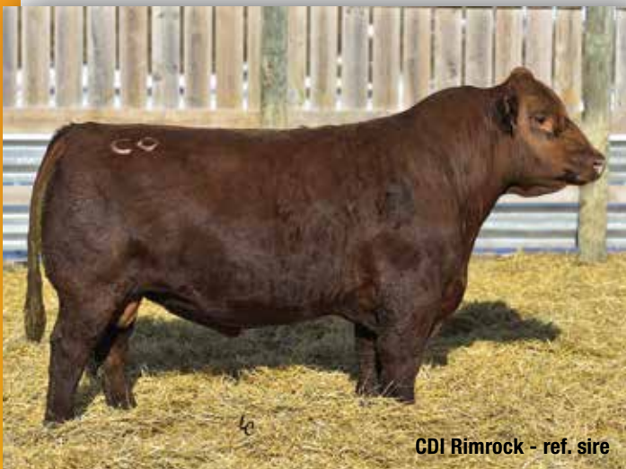
CDI Rimrock - ref. sire

Ald to WHF Ten High, ASA#3118629 on 3/10/18