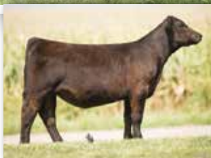
JS Gypsy Soul 52F - daughter of 105B

Recipient Cow - Tattoo A20 Sire: JF Milestone. Dam: Ankony Ms Primrose T145