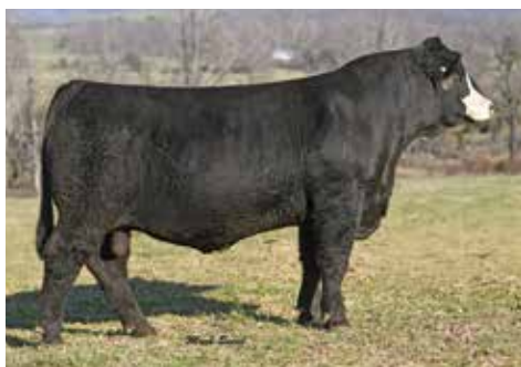
SVS Rawhide ASA#30000007