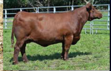
EKHCC Red Jewel 760 - ref. dam