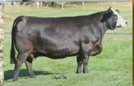
HPF Misti U353 - ref. dam