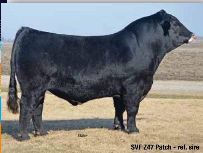
SVF Z47 Patch - ref. sire