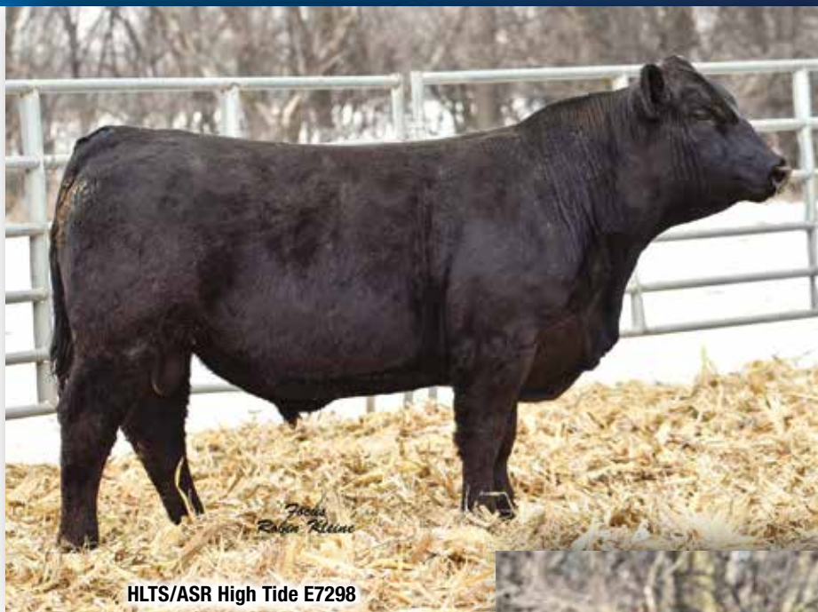
HLTS/ASR High Tide E7298