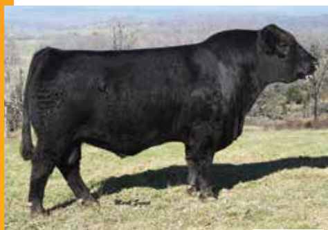
SVS Badlands ASA#2947416