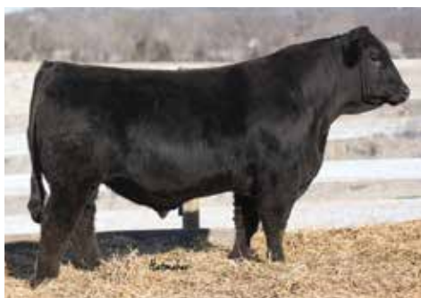
WHF Ten High C247 ASA#3118629