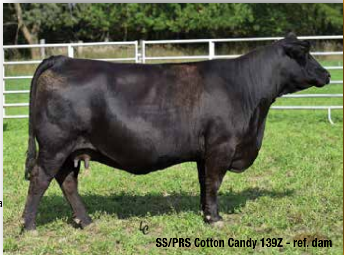
SS/PRS Cotton Candy 139Z - ref. dam

Adding some elite genetics via frozen genetics and embryo transfer is great way to obtain the elite. Cotton Candy is from the highly proven Miley Cottontail and the proven Pays To Dream. Oracle was a standout as a calf and is already producing at a high level. The progeny of both sexes are awesome. Data Breach a son was champion bull at the North American.