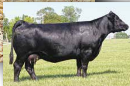
Triple C Shear Design S03M - ref. dam