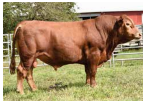
LCDR American Outlaw 682D ASA#3287017