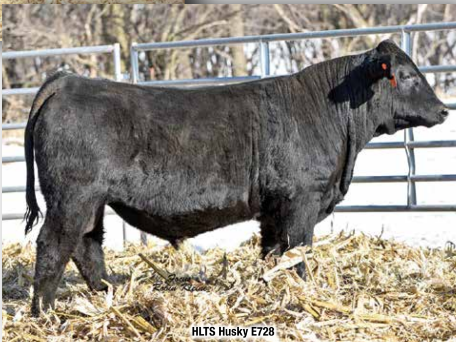
HLTS Husky E728