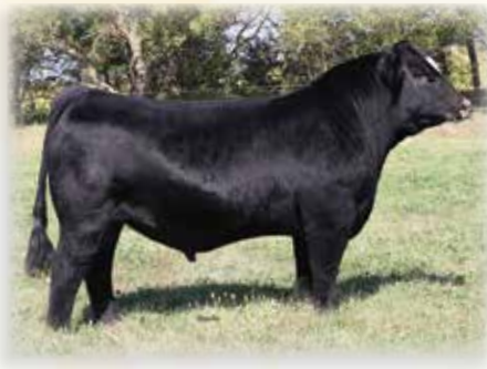
Mr CCF 20-20 - ref. sire