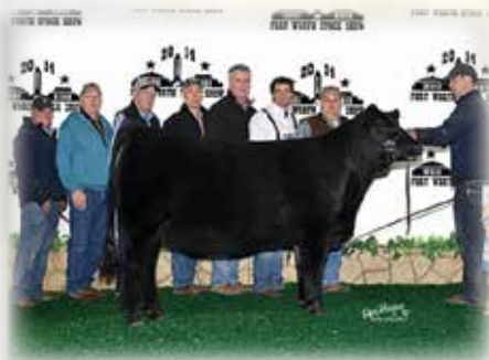
HPF Right To Love Z338 - ref dam