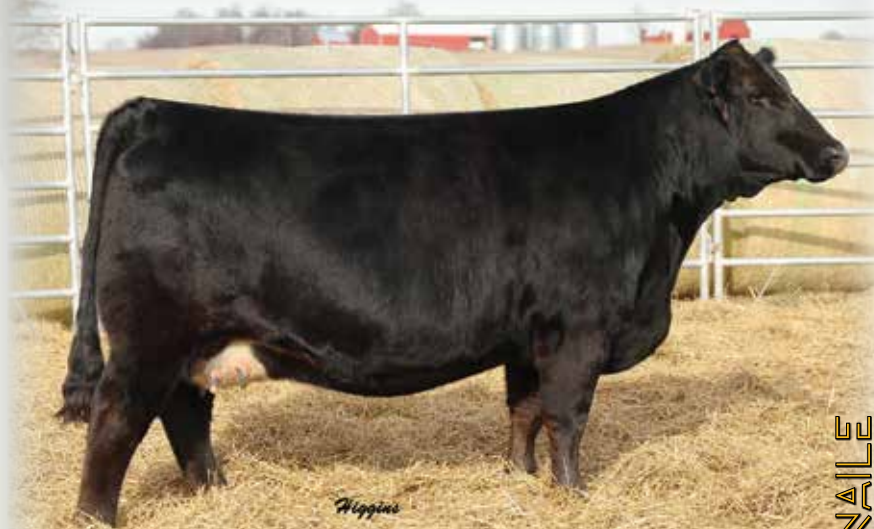
WLE Missy Z4293 - ref. dam