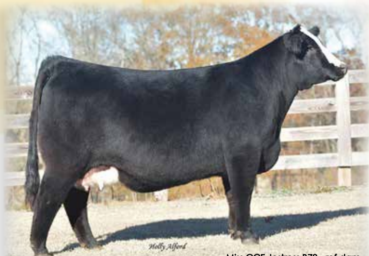
Miss CCF Jestress B79 - ref dam