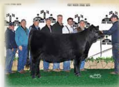
HPF Right To Love Z338 - ref. dam