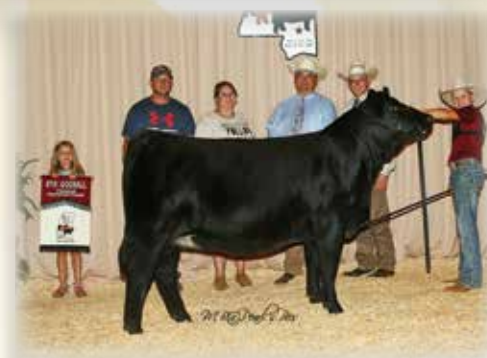
Grand Fortune x Y100 daughter

Consignor: Double Image Cattle Co & Bramlet Simmentals