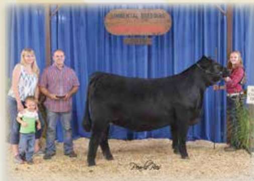
ESF Miss Sheza Hottie daughters