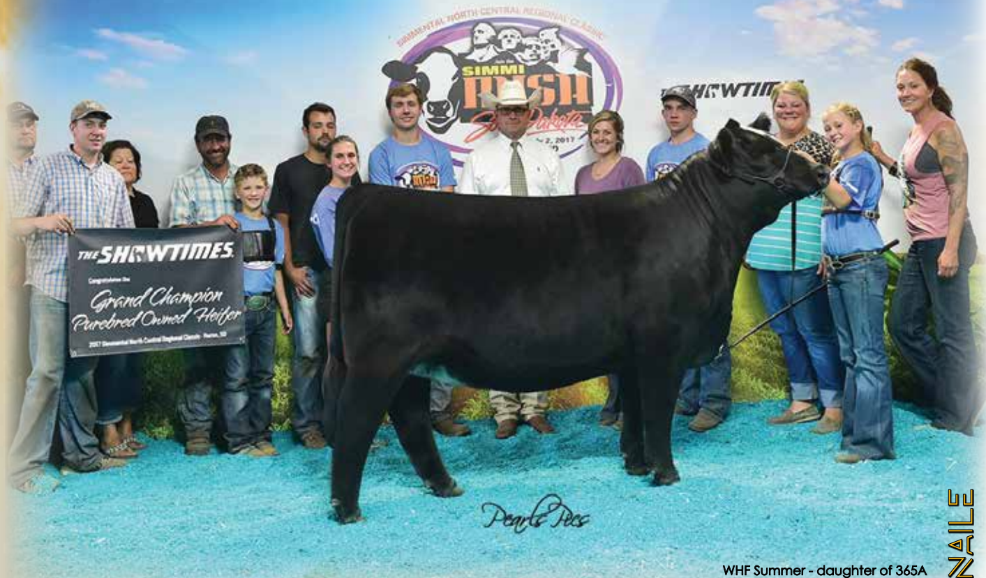
WHF Summer - daughter of 365A