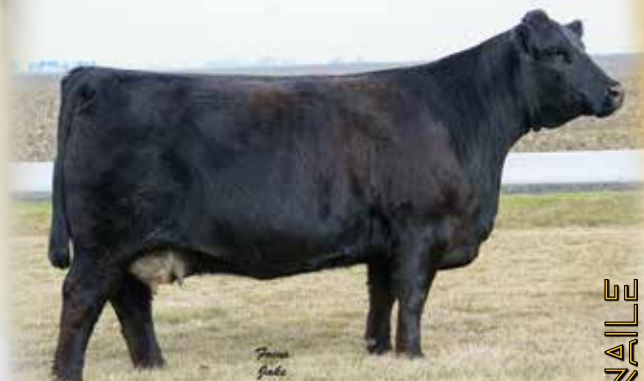
WLE Miss U409 - ref. dam