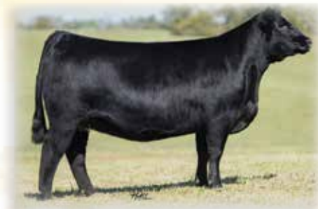
maternal sister to 518D