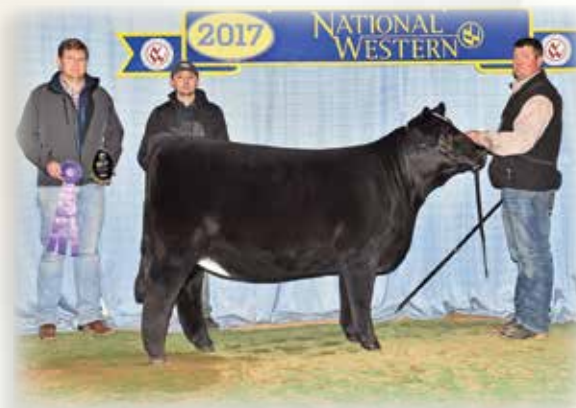
WHF Summer - daughter of 365A