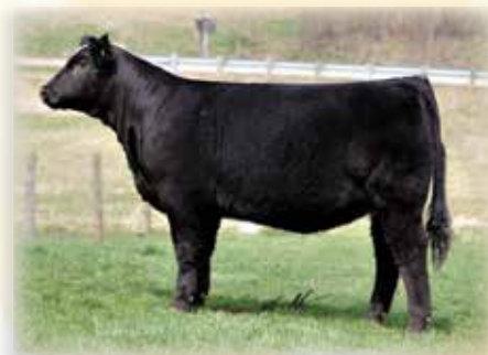
Miss USA x Mr HOC Broker daughter

3 IVF Embryos sire: Meyer Ranch 734 Guaranteeing 1 Pregnancy 2342210 dam: WAG Hairietta 9145J CAX Angus