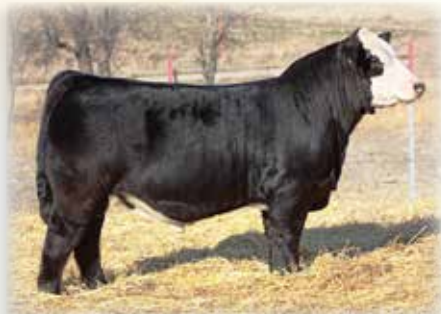
W/C Loaded Up 1119Y - ref sire

CAJS Sweet Emotion has had unbelievable success in a short amount of time. Her first flush that we sold produced two AI bulls which were also part of the Grand Champion pen of three bulls in Denver. A heifer Miss Seein Purple that claimed show victories starting with Grand at the Kansas State Fair Spring heifer Jackpot show followed Reserve Grand and Grand Purebred Nebraska AGR Winter Classic. Purchased by Wheatland Cattle and Michelson Land and cattle for $90,000 Valuation's Purple was then selected 4th overall 2017 National Western Stock Show Prospect followed by Reserve Grand Champion PB North Central Regional Classic. I can't wait to see what she does as a bedcaps Sweet Emotion is a full sib to CAJS Khloe that produced Blaze of Glory! MS Emotion D675 is graced with the same attributes as Seeing Purple, long necked, big boned, monster topped and unbelievable hair. MS Emotion is going to take someone on a fun ride from show to Donor pen Start a Legacy show her in Louisville and Denver she will make your farm proud. 3 IVF non-sexed W/C Loaded Up.