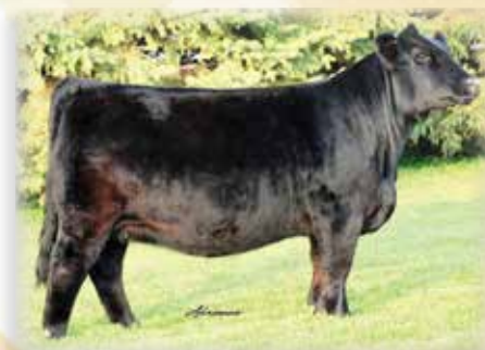
HS Cool Burn C16X - ref. dam