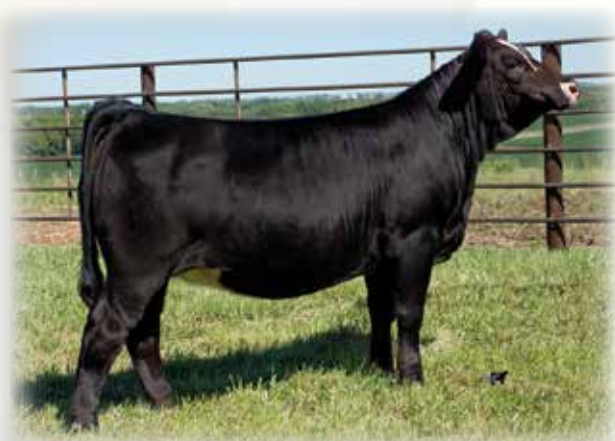
Daughter - reference