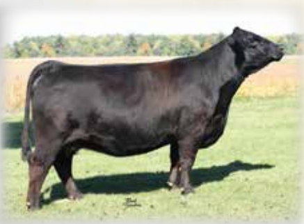
Miss Knockout 74T - ref. dam