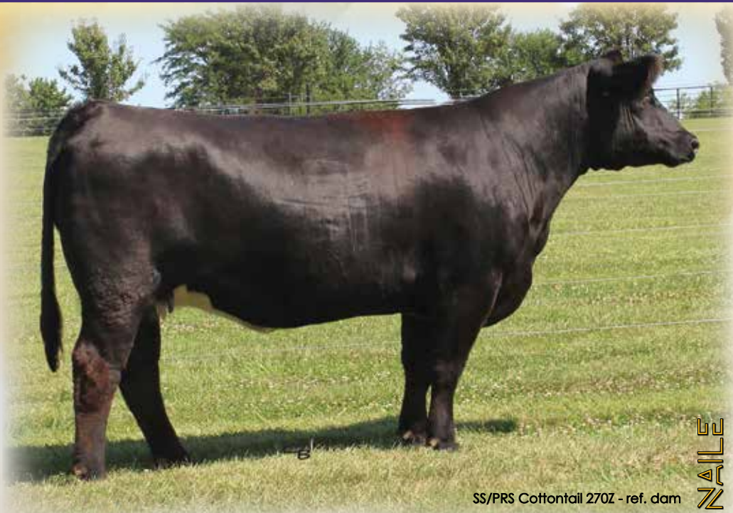
SS/PRS Cottontail 270Z - ref. dam