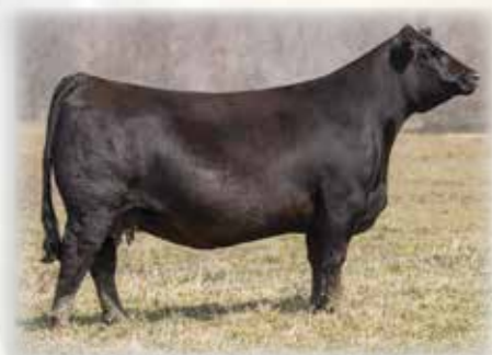
SS/TBT Khloe 200Y - ref. dam