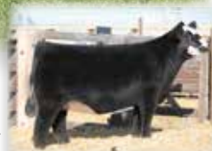
UKN Whiskey Lullaby B1- ref. sire