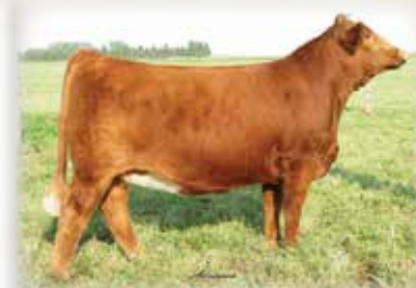
HS/HSF Beautiful Dream - ref. dam