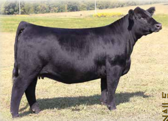
TNGL A Gemstone A527 - ref. dam

Consignor: Trent Templeton / Aaron Breheim