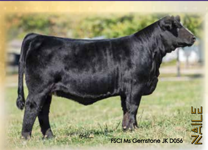
FSCI Ms Gemstone JK D056