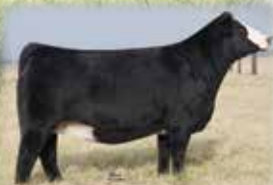
K-LER/RC Miss Hoya Saxa - ref. dam

These Style daughters continue to dominate the show ring & have begun to lead in the donor pen; and this percentage stand-out will be no different. We decided to flush Miss Hoya Saxa to a few percentage matings, and we hit a home run here! The progeny from this mating continue to gain steam as they mature, and we look forward to what the future holds. Built the way you need them from the ground up, with plenty of swoop to her belly line, just the right muscle shape, and a stunning view from the side. It's not all phenotype that turns your head, this one is astonishing on paper as well. Dig in deep on this beauty because opportunities like this don't come knocking every day!